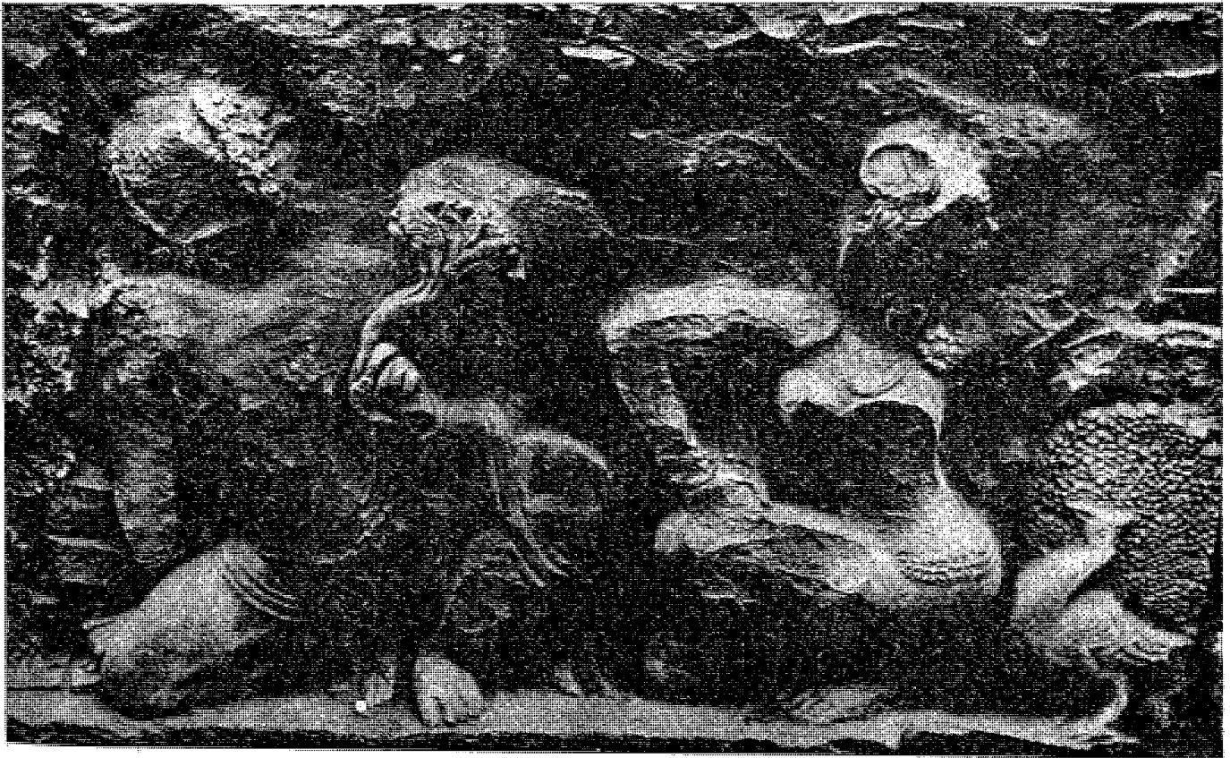
ख. आनन्दपूर्वक नाचिरहेका शिवपार्वती । हेर्नुहोस् पृ. ३१ । B. Siva and Parvati dancing in ecstasy. See page 31.