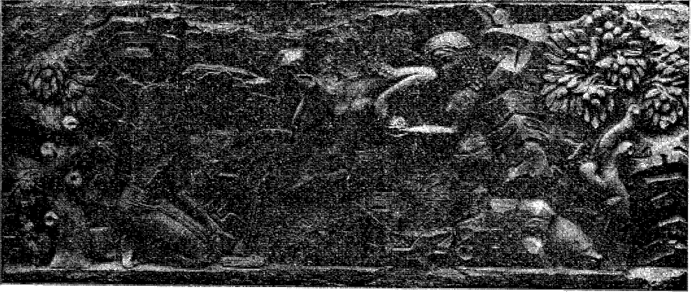
क. अपर्णाको रूपमा रहेकी पार्वतीको प्रस्तरमूर्ति । हेर्नुहोस् पृ. २९-३० । A. Parvati in penance as Aparna. See pages 29-30.