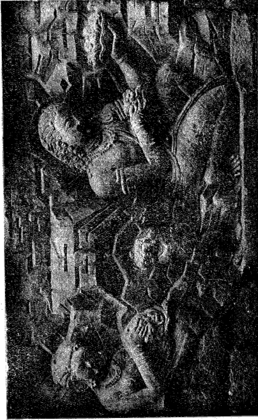
ख. कुमारको जन्मोत्सव मनाइरहेका कुमार सहित शिवपार्वती । हेनुहोस् पृ. ३१ । B. Siva and Parvati with infant Kumara, celebrating his birth. See page 31.