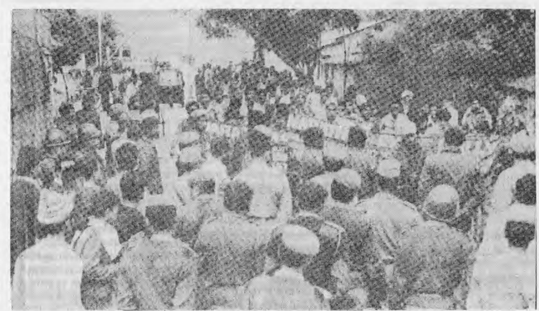
Cycle rallyists face the Indian police at Panitanki on January 3.

Three groups of cyclists were picked up by the Indian police at Panitanki, Naxalbari and Bagdogra, and deported to Nepal on January 2 and 3. On the afternoon of January 3, 96 cyclists were arrested at Panitanki when they defied the ban. Housed temporarily in a tea warehouse near Naxalbari, they were moved to Siliguri next day. Cyclists were also picked up in Siliguri (6 on Jan 4), Ethelbari (5 on Jan 5) and