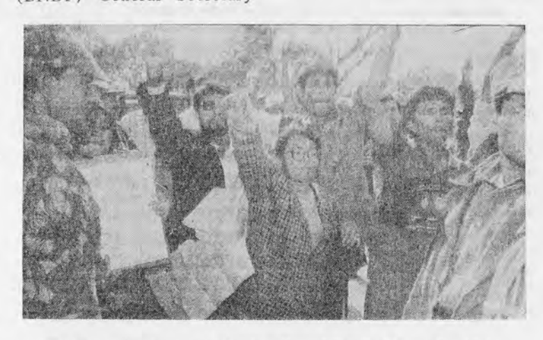
Past the security net - demonstration in Mangalbare on January 7.