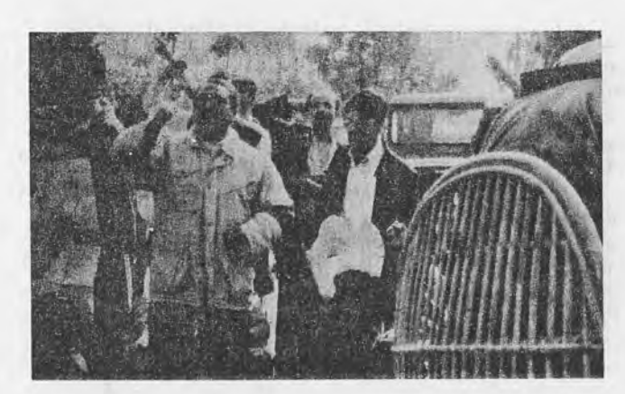
Courting Arrest - Mangalbare, January 7.