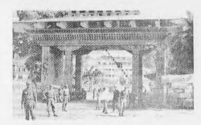
Gateway to the Kingdom, Phuntsholing from the Indian side, January 7.

Those arrested on January 7 were taken to Alipurduar jail the same day. On January 12, a group of 103 persons were released after signing Personal Release bonds. The remaining nine persons were released unconditionally on January 14.