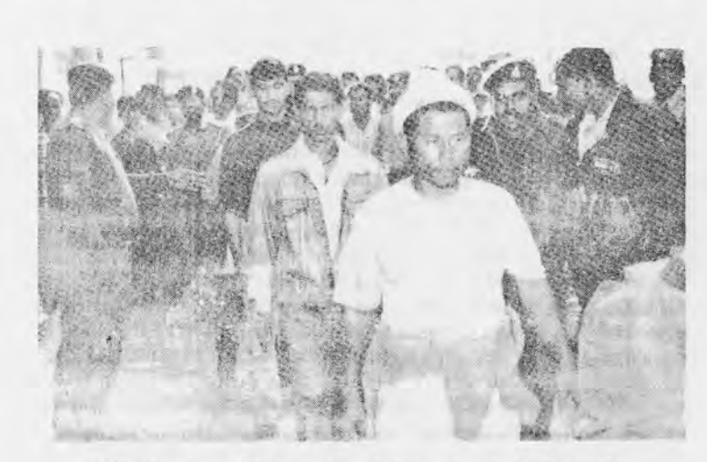
The 96 cyclists being produced in court on January 4.