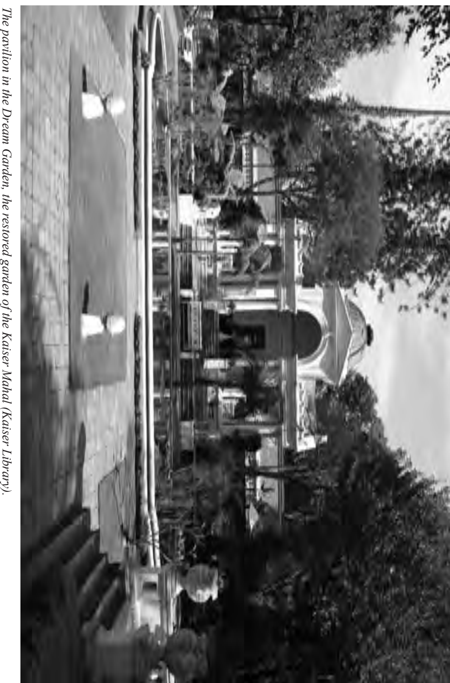
The pavilion in the Dream Garden, the restored garden of the Kaiser Mahal (Kaiser Library).