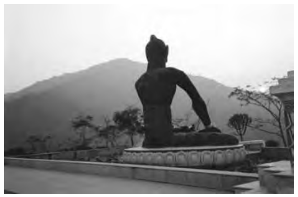
The bronze Buddha at Badamtam.