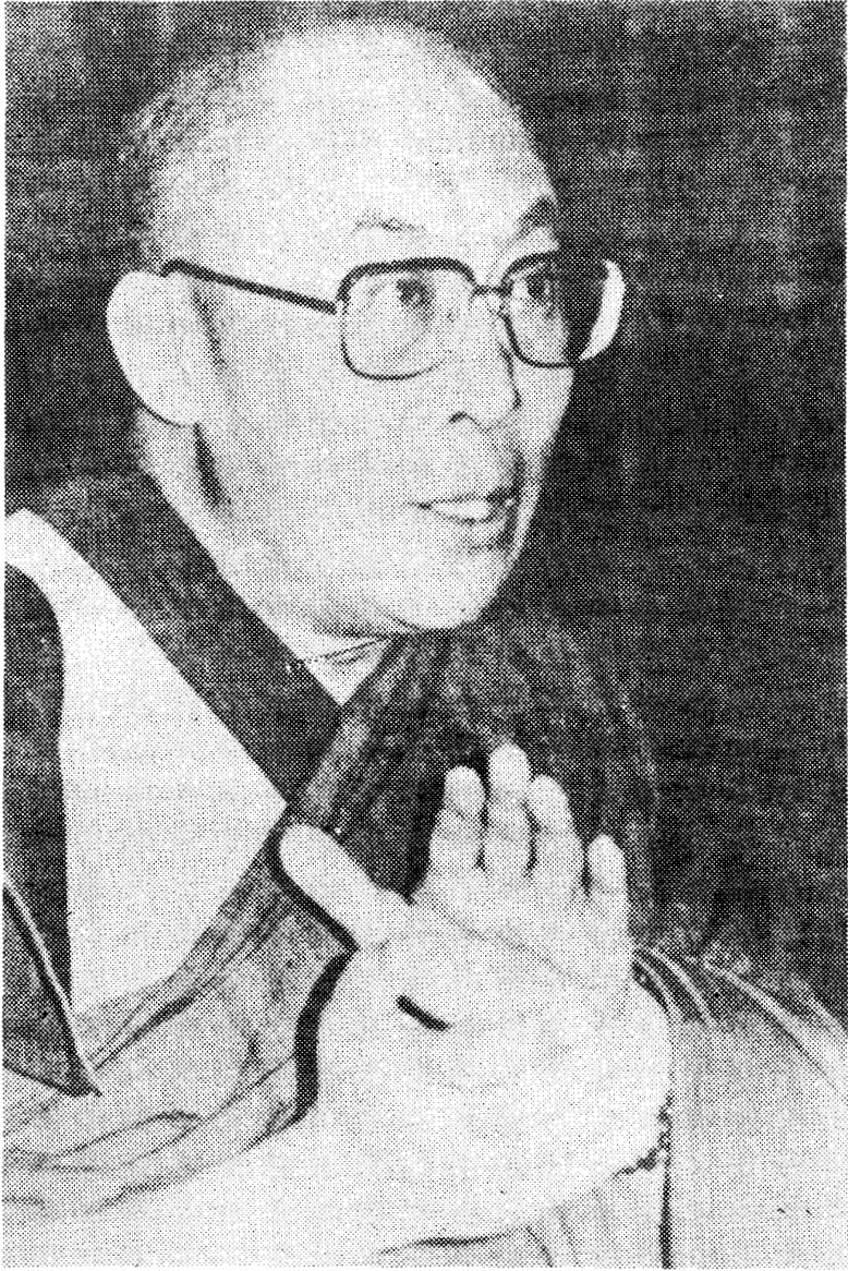
H.H. THE DALAI LAMA