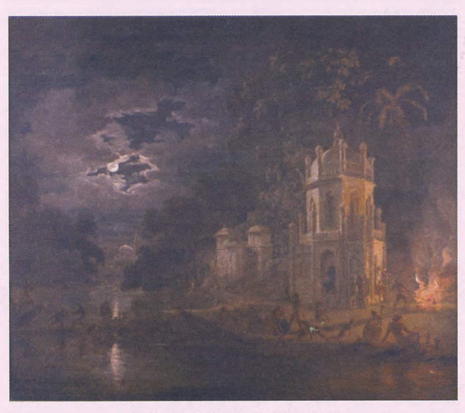
The hauntingly beautiful Narinda cemetery, Dacca, by Johann Zoffany (see page 34)