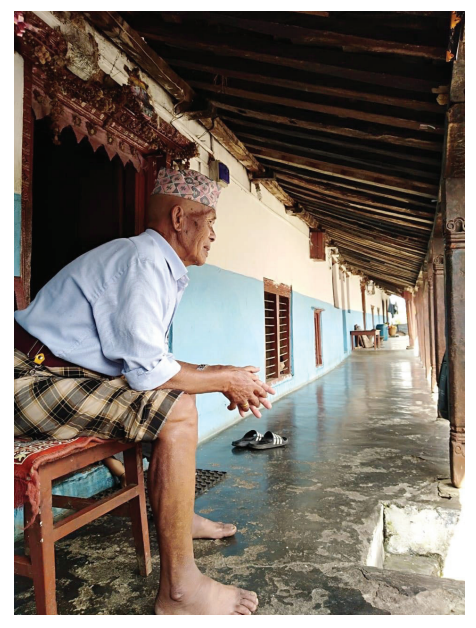
Figure 1: An old ex-Gorkha Gurung soldier lives with his wife in a longhouse under the same roof as his relatives, but in separate households (Ghachowk, 2018)

Separate households of a smaller size are not only the result of increased mobility and migration of the young to urban areas and abroad for education purposes and work opportunities: this phenomenon also correlates with the changing role of women. The following section