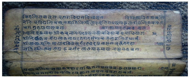
Figure 2. The second folio of the Sanskrit Tridalakamala caryāgīti in pracalit script included in the manuscript from Bhaktapur (B-PS).