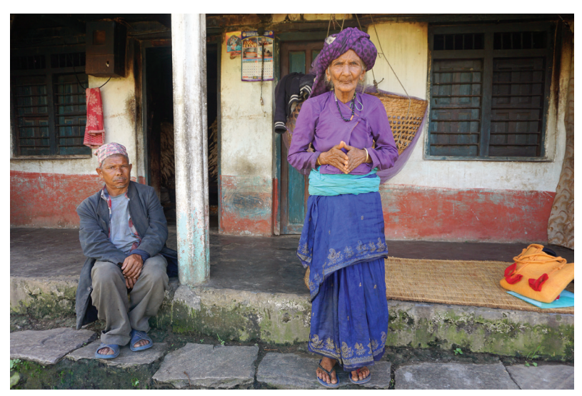
Figure 2: An 82-year-old Brahmin woman stands in front of her house explaining that her three sons (1 married with 3 children, 2 with a disability) live under the same roof but have separate kitchens (Ghachowk, 2016, S. Speck)

reveals the consequences of these developments on women's status, in particular the status of the daughter-in-law.