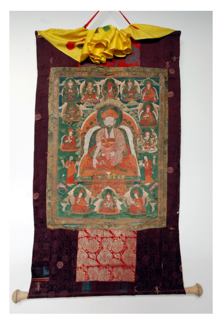
Figure 3: Zhabdrung Phunsum Tshogpa, late 17<sup>th</sup> century, Ground mineral pigment on cotton, H: 123 x W: 69 cm., Collection of the National Museum of Bhutan, Paro.