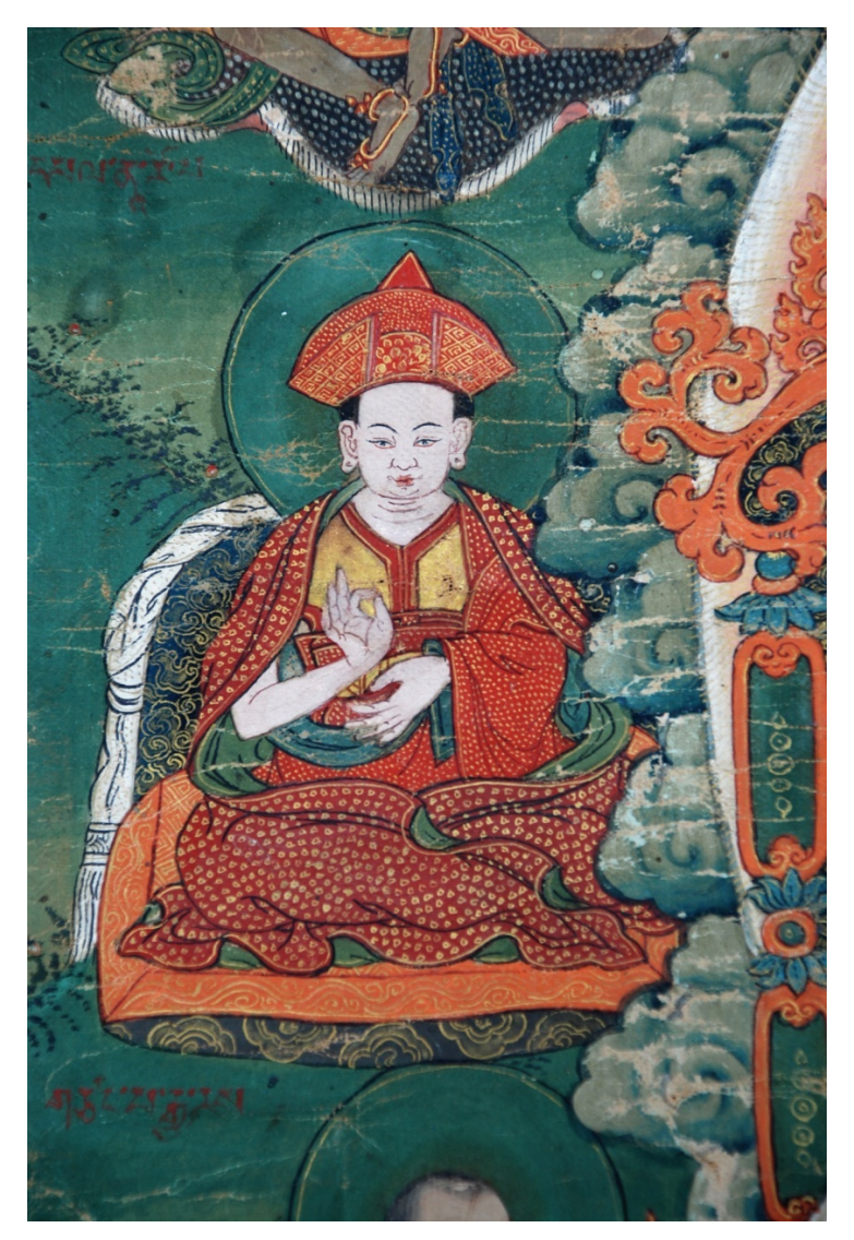
Figure 9: Detail, Tsangpa Gyare Yeshe Dorje, Zhabdrung Phunsum Tshogpa.