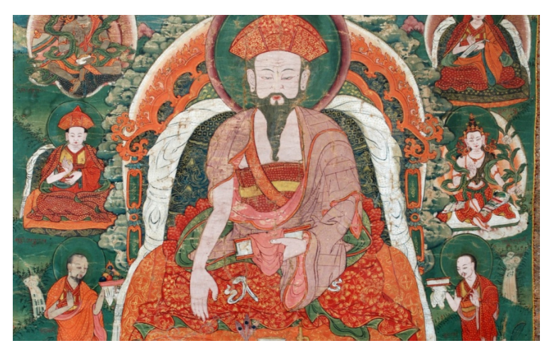
Figure 14: Detail, central section, Zhabdrung Phunsum Tshogpa.