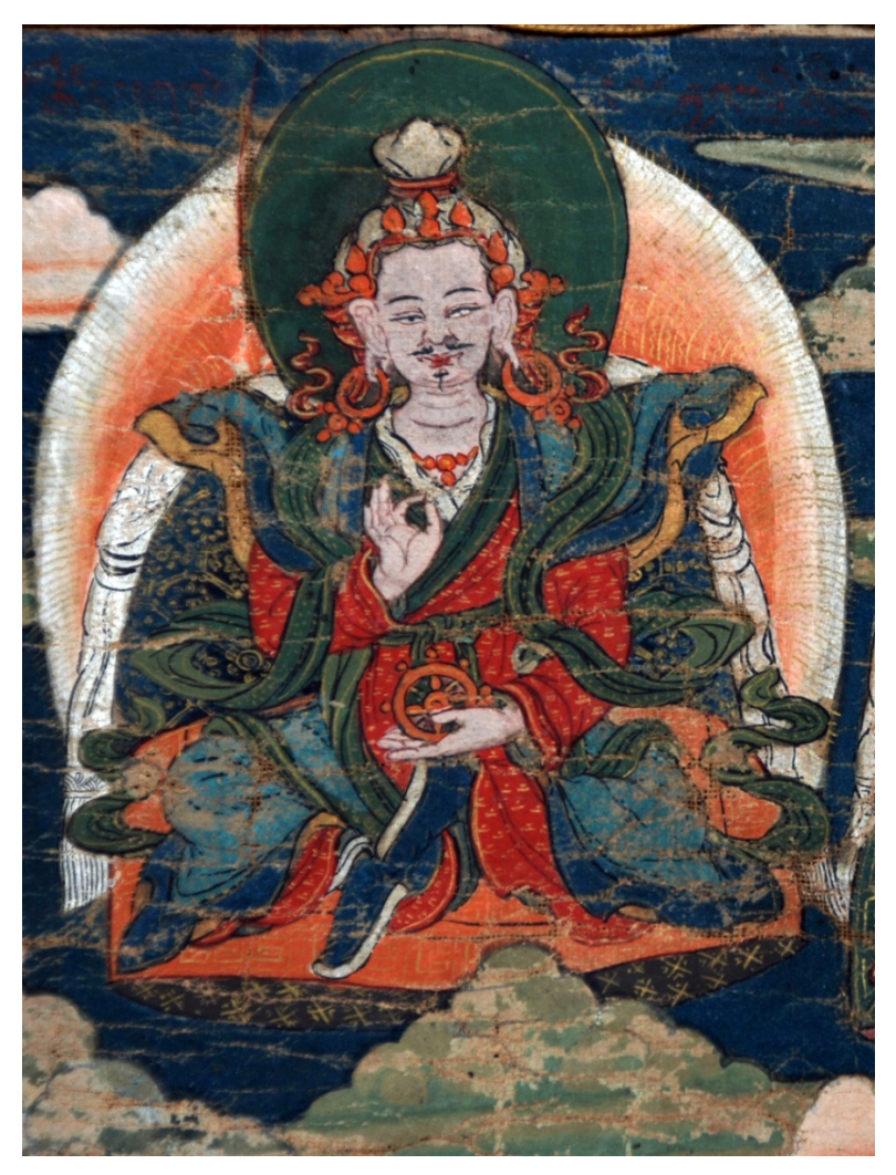
Figure 15: Detail, Trisong Detsen, Zhabdrung Phunsum Tshogpa.