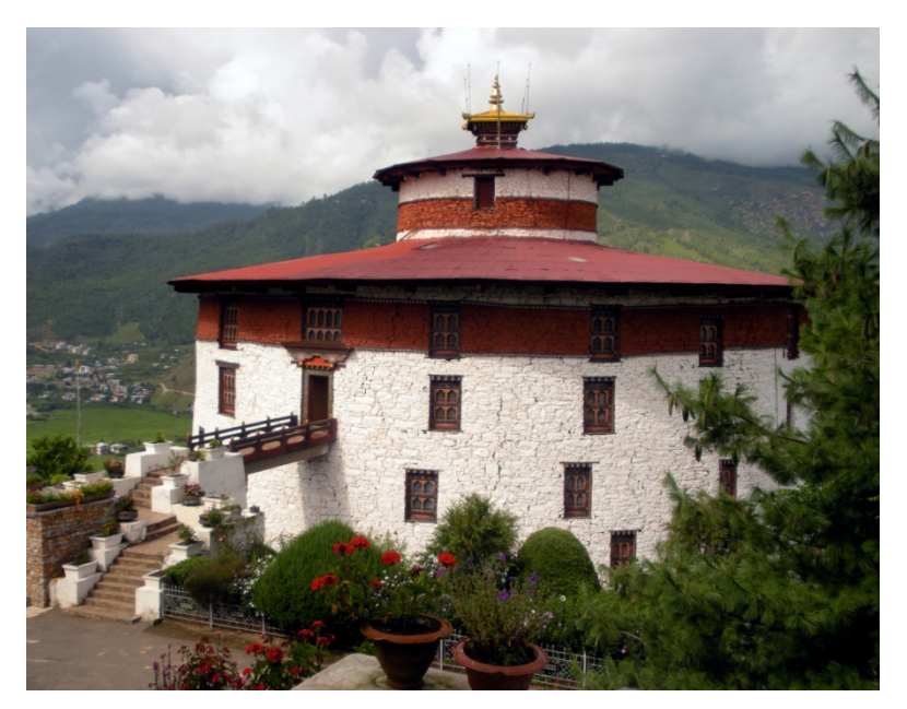
Figure 1: National Museum of Bhutan, Paro.