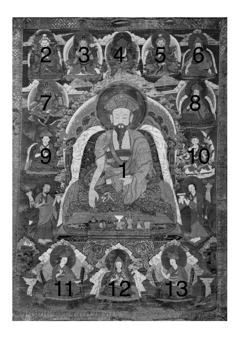
Figure 4: Greyscale image of Zhabdrung Phunsum Tshogpa with numbered figures.