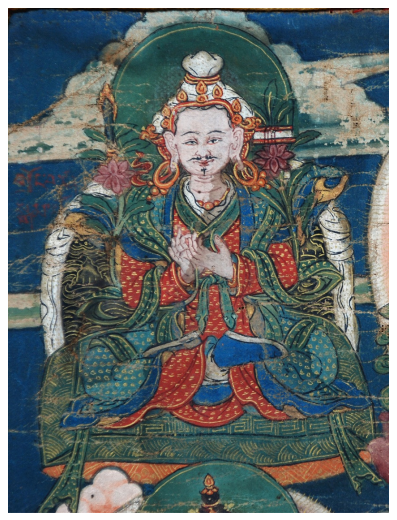
Figure 5: Detail, Songtsen Gampo, Zhabdrung Phunsum Tshogpa.