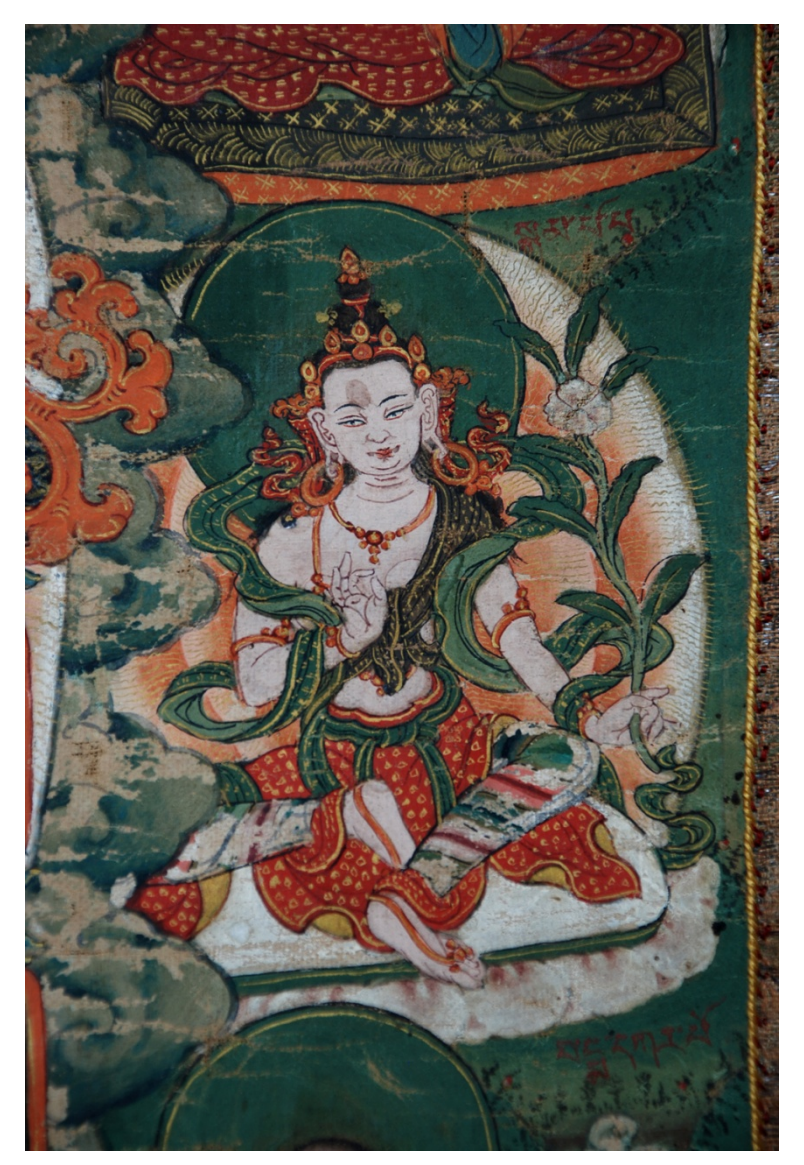
Figure 12: Detail, Pema Karpo, Zhabdrung Phunsum Tshogpa.