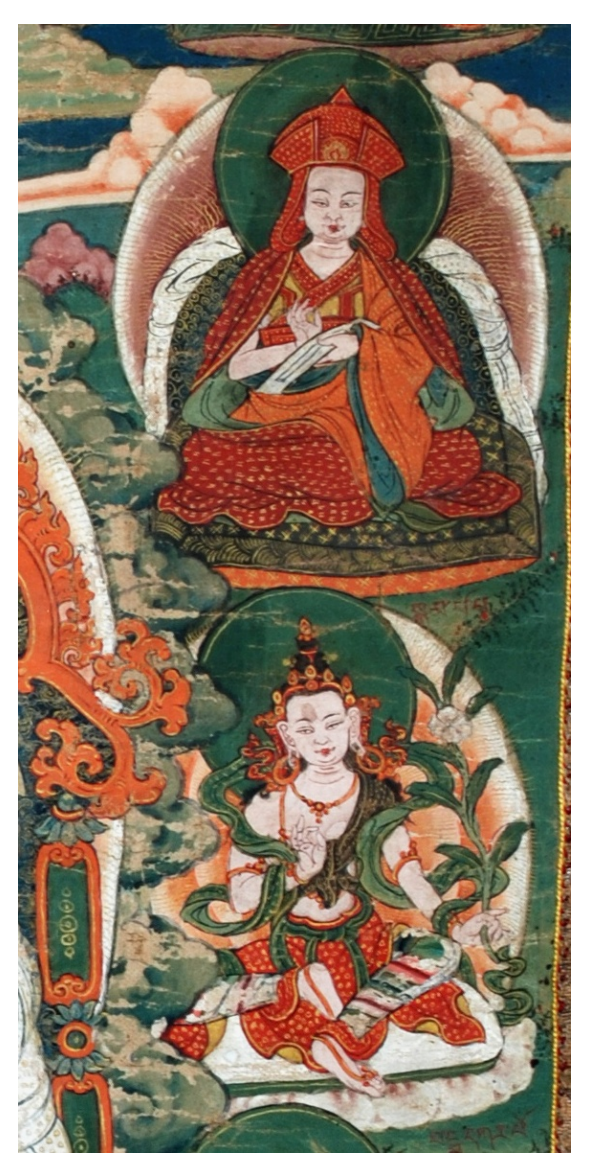
Figure 13: Detail, Pema Karpo and Gampopa, Zhabdrung Phunsum Tshogpa.