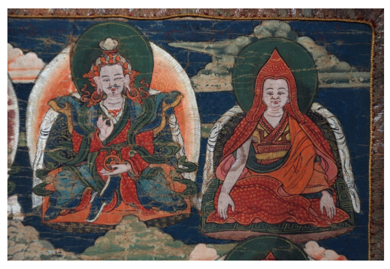
Figure 6: Detail, Santarakshita and Trisong Detsen, Zhabdrung Phunsum Tshogpa.