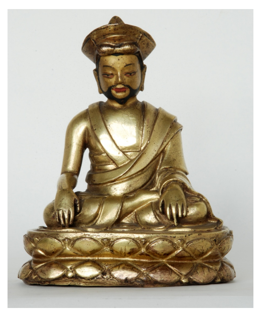
Figure 11: Yab Tenpai Nyima, ca. 18<sup>th</sup> century, Metal alloy with pigment, H: 18 cm W: 12 cm., Collection of the National Museum of Bhutan, Paro.