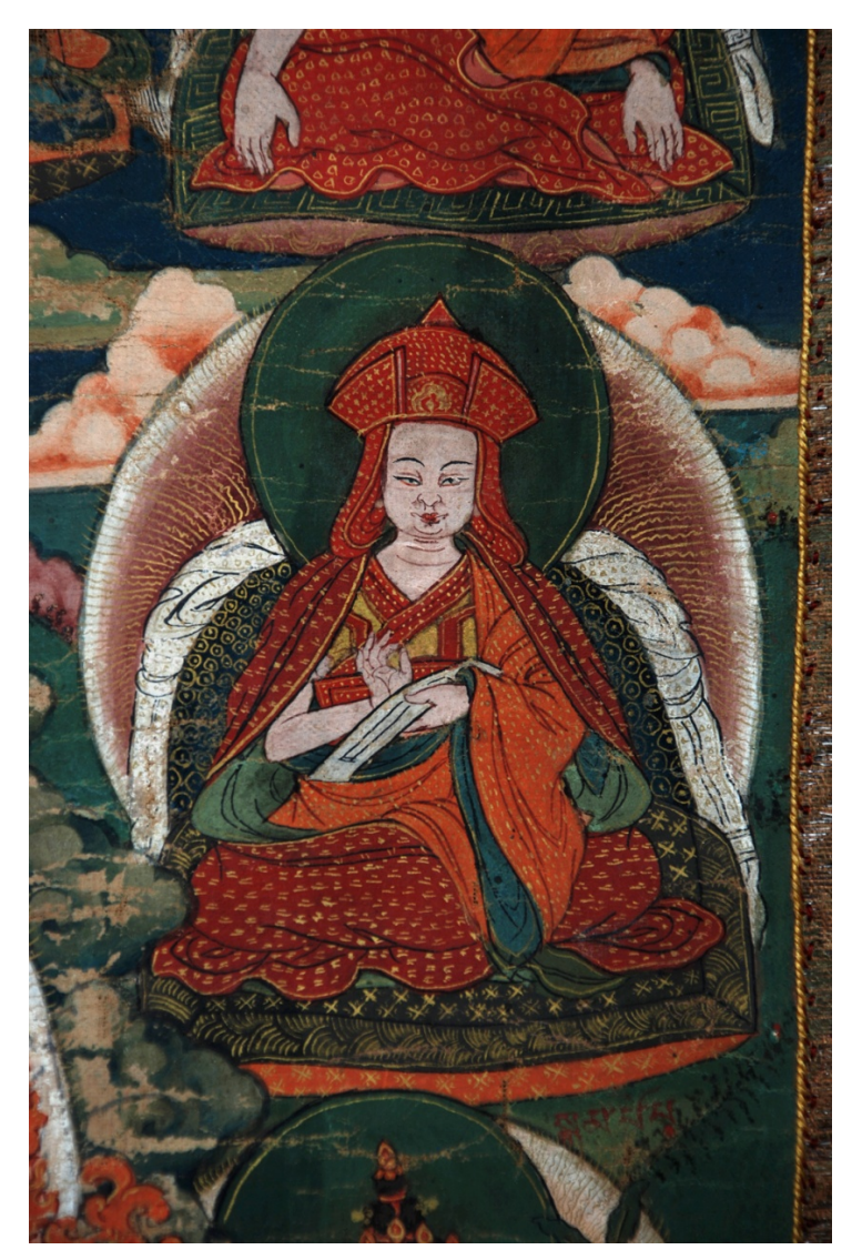
Figure 8: Detail, Gampopa, Zhabdrung Phunsum Tshogpa.