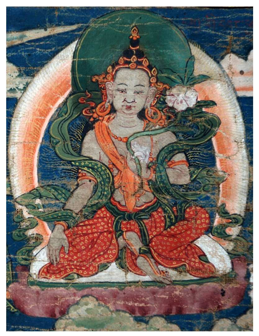
Figure 10: Detail, Ngagi Wangchuk, Zhabdrung Phunsum Tshogpa.