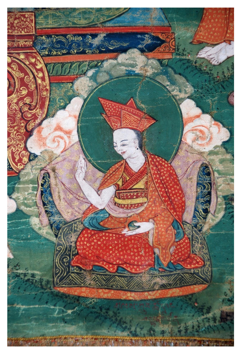
Figure 18: Detail, Mipham Tshewang Tenzin, Zhabdrung Phunsum Tshogpa.