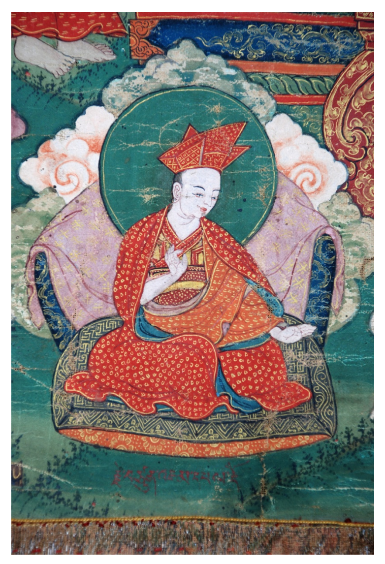
Figure 16: Detail, Jampel Dorje, Zhabdrung Phunsum Tshogpa.