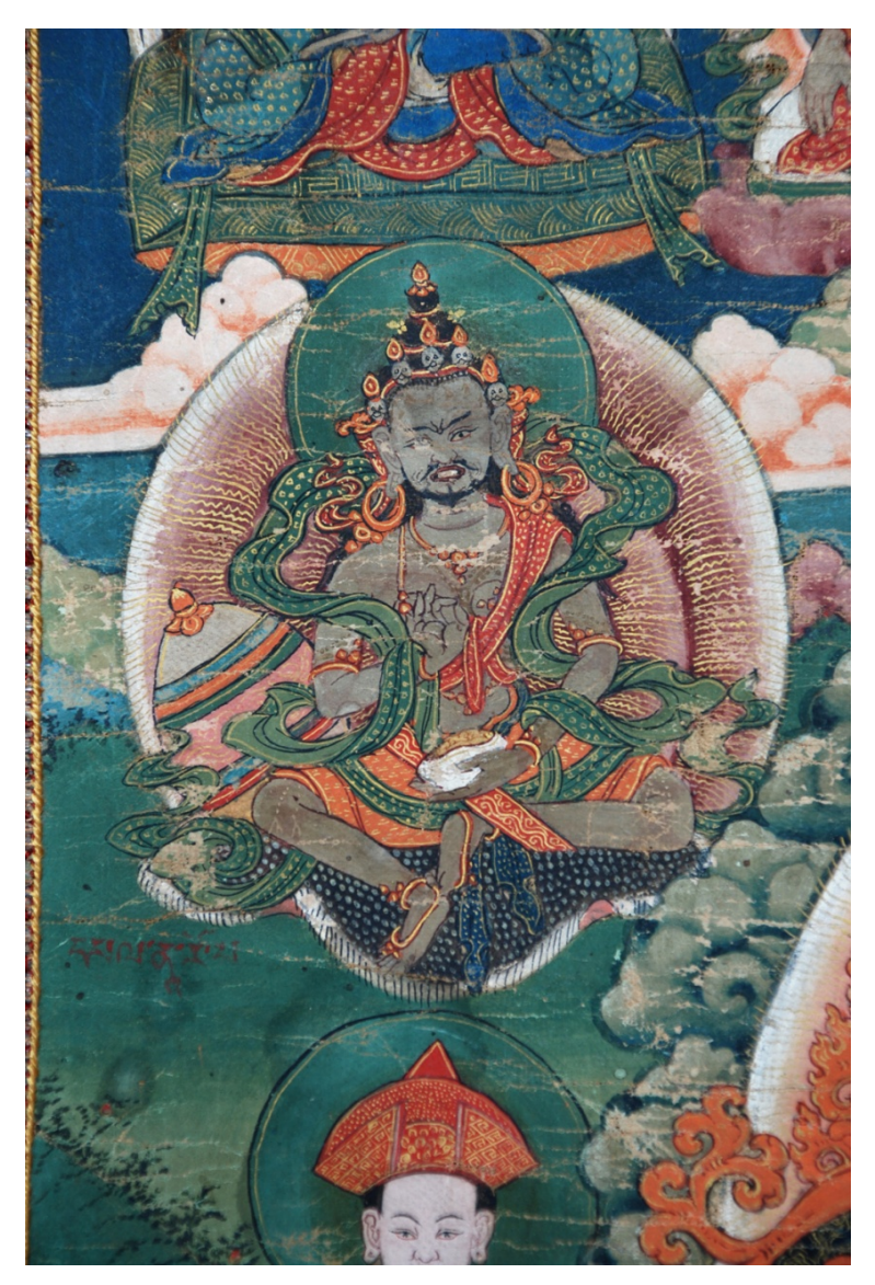
Figure 7: Detail, Naropa, Zhabdrung Phunsum Tshogpa.