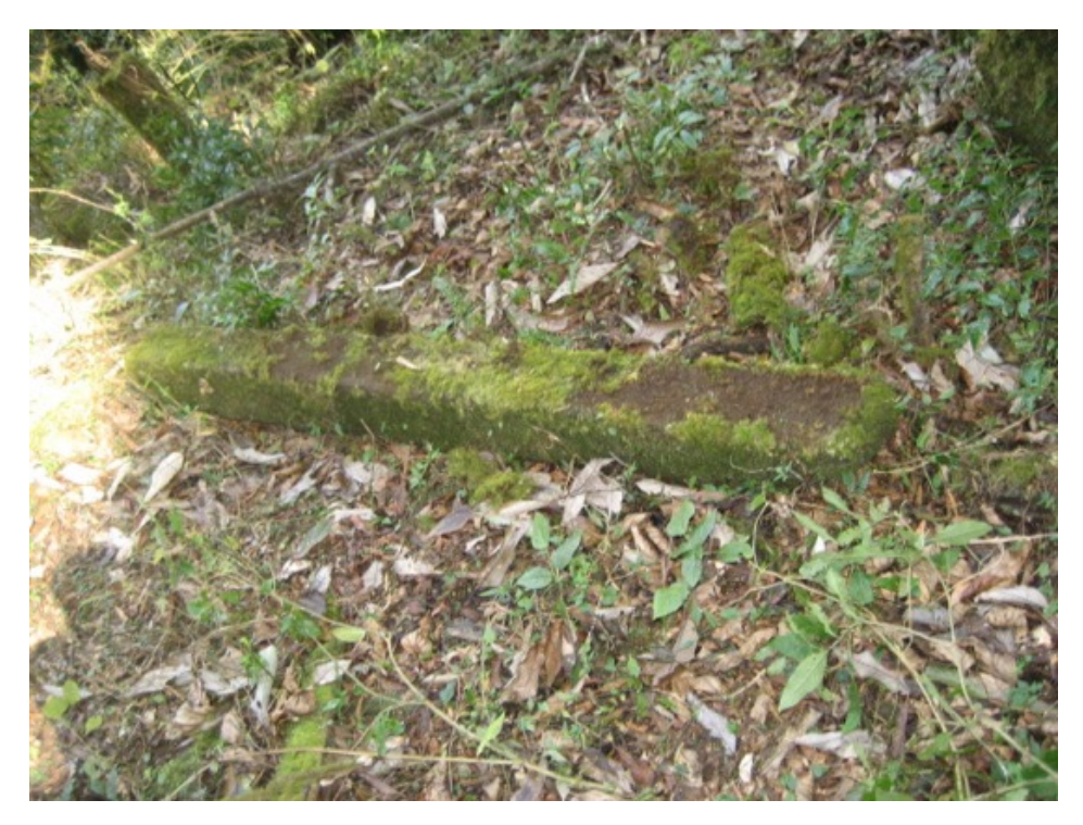
Figure 4: One of stone pillars of Wamling, Zhemgang; Photography by the author, 2007.

stone pillars and planks meant for building Samchodrong can be found in the forests above the village (Figure 4) (Dorji Penjore, 2011).