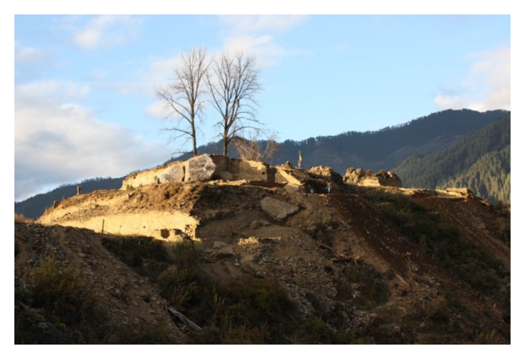
Figure 6: Drapham Dzong after the excavation; Photography by Kuenga Wangmo, 2014.

largest structure in Asian Buddhist countries, and the largest Dzong predating the Zhabdrung era. It is believed that the Chokhor Deb himself blew up the dzong as he abandoned it to escape the Tibetan invasion.