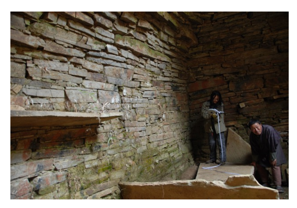
Figure 8: Inside the Bangtsho Underground Fortress; Photography by Kuenga Wangmo, 2014.