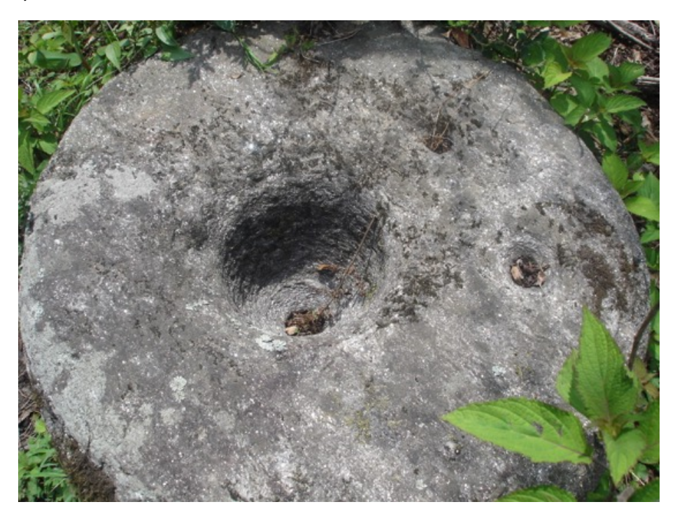
Figure 5: One of the 68 bowls found scattered along slopes in Minjey, Lhuntse; Photography by Dorji Gyeltsen, 2011.

specialisation in agriculture, arts, craft, and other skills. It could be possible that the local people might have used these stones to husk paddy into rice. It is believed there are 108 such stones.