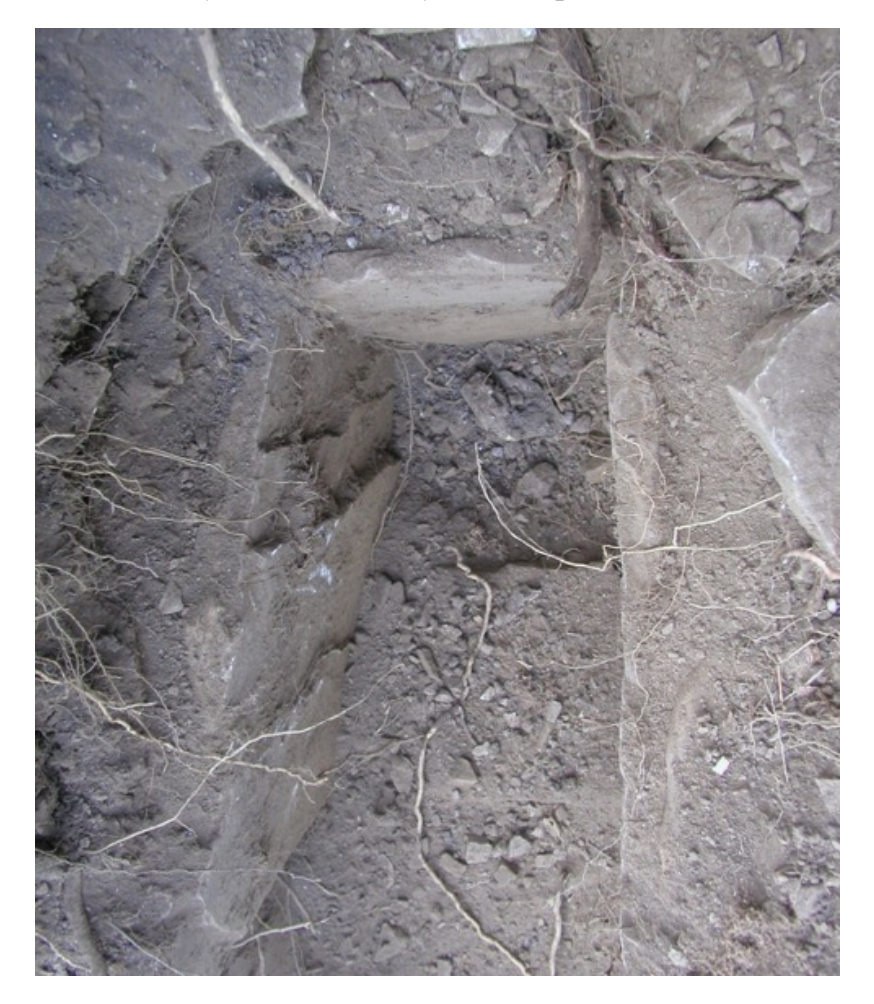
Figure 10: Burial Graves of Masang Daza, Mongar; Photo by Ugyen Pelgen.

In August 2004, a farmer's plowshare in Masang Daza village in Lingmithang in eastern Bhutan hit a stone structure that happened to be a burial grave. Subsequently, 20 tombs were discovered. The land was formerly used as pastureland but settled only in early 1980s. The tomb measuring 5 feet by 18 inches by 14 inches is located on the left bank of Moiri River and near the ruins of the castle of Tongphu King (c.113-115) who was a descendant of Lhasay Tsangma. The ruins of the Zhongar Dzong are also near the site. The Bhutanese bury the dead only in exceptional case.