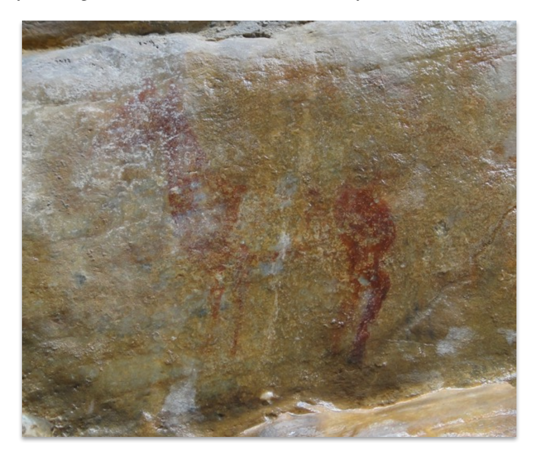
Figure 1: Pre-historic rock painting discovered by Kuenga Wangmo at Gasa; Photography by Kuenga Wangmo, 2014.

inscription written with charcoal, and mani -mantras written in synthetic paint had in turn erased the earlier layers.