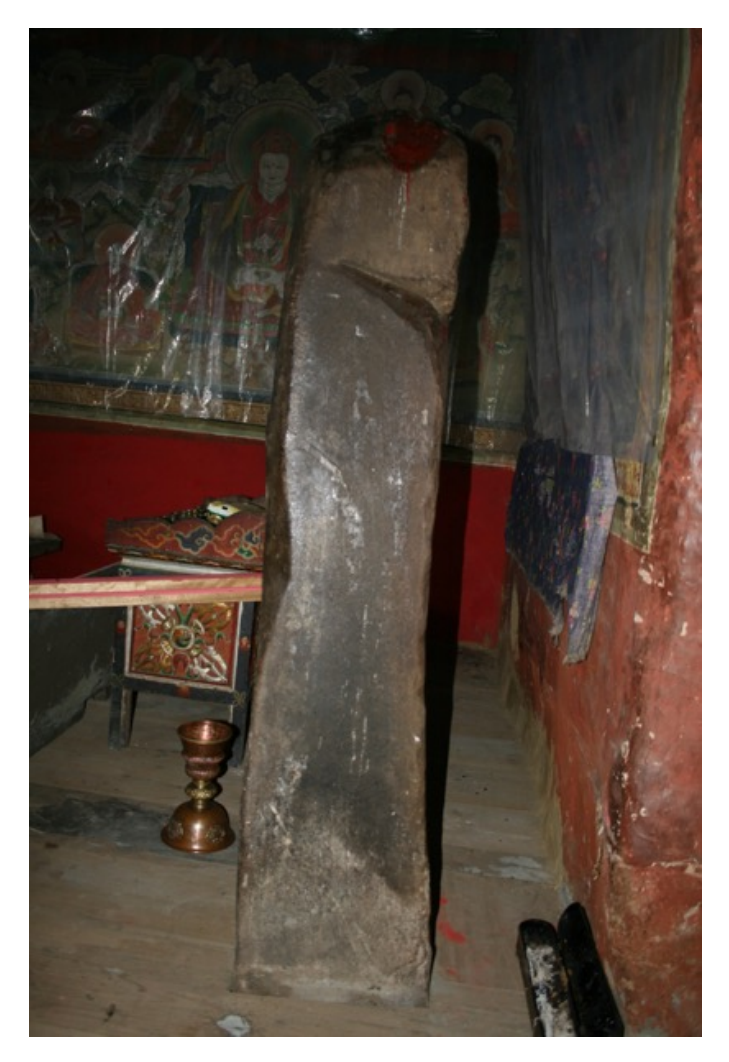
Figure 3: Oath stone of Nabje; Photography by Dorji Gyeltshen.

There are standing megaliths ( doring , rdo ring ) in the central Bhutan that might have served as boundary or ritual purpose. Megalith in Shaithangla, a pass between Ura and Tang valleys, was clearly used as border demarcation (Aris, 1979). In Konchogsum lhakhang there is a pillar inside a mortar, and pillar plinth and its fragment. Similarly, stone pillars are kept outside the Sombrang lhakhang in Bumthang.