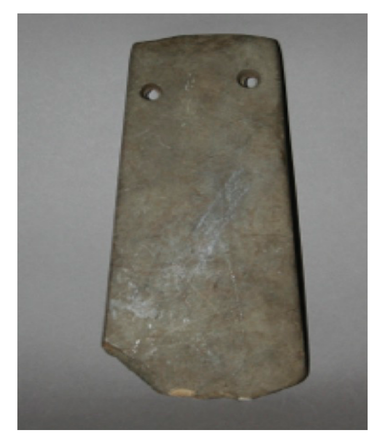
Figure 2: Iron from the sky (adze); National Museum of Bhutan, Paro.

According to the Buddhist cosmology, the gods ( lha ) and demi-gods ( lha ma yin ) are in a state of perpetual war over the fruits of a wishgranting tree ( dpag bsam gyi shing ). The gods throw down iron axes ( gnam lcag : 'iron from the sky' or gnam lcag sta re : 'iron axe from the sky') while the demi-gods shoot up pressurised gases ( sa chu ) from the earth. Stone tools in the form of axes (adzes) which the Bhutanese farmers come across in farms are believed to be the weapons of the gods, and as such they are treasured as prosperity-bringing power objects. Because they are invested with sacred power, farmers preserve these stone objects. Most Bhutanese houses possess at least one of these stones. The National Museum of Bhutan in Paro has a collection of adzes of different shapes and sizes.