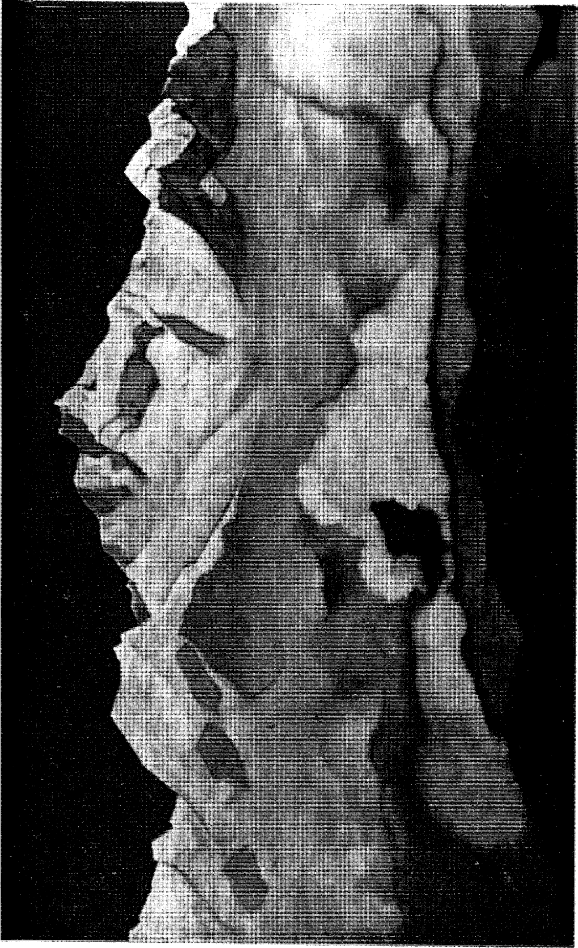
From a painting by Nicholas Roerich