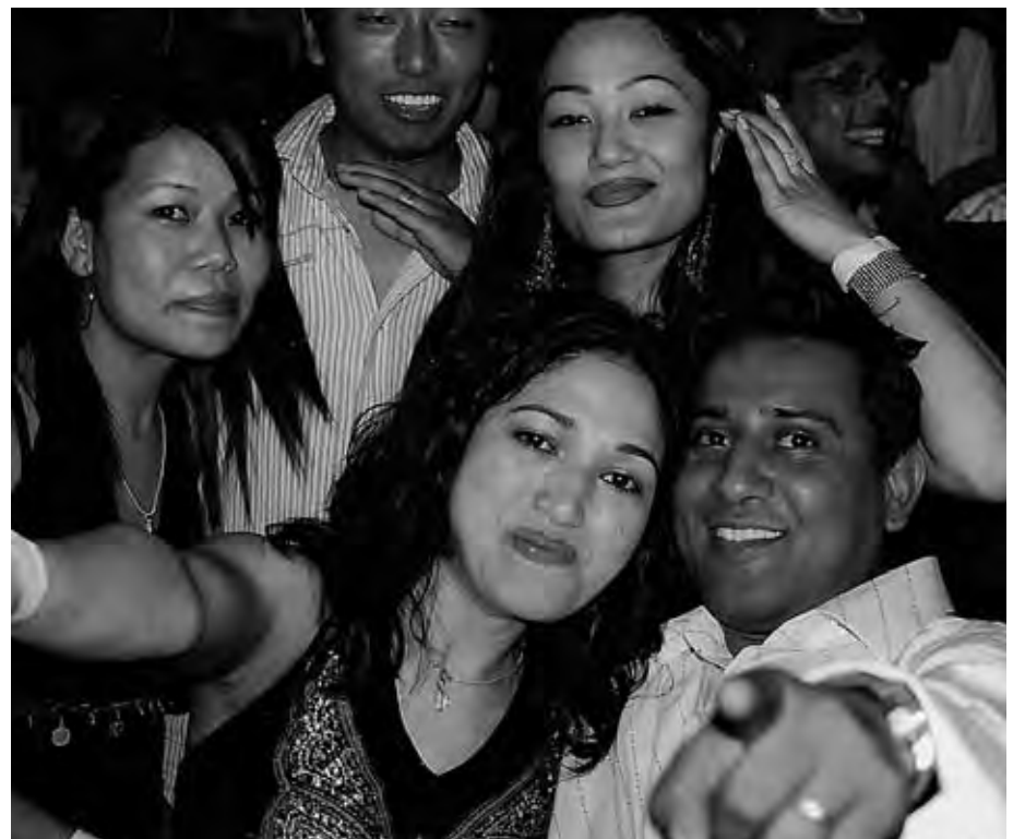
L: Nepalis in Ridgewood Society celebrate Nepali New Year; R: The part at Dhaka Club was a grand success as well.