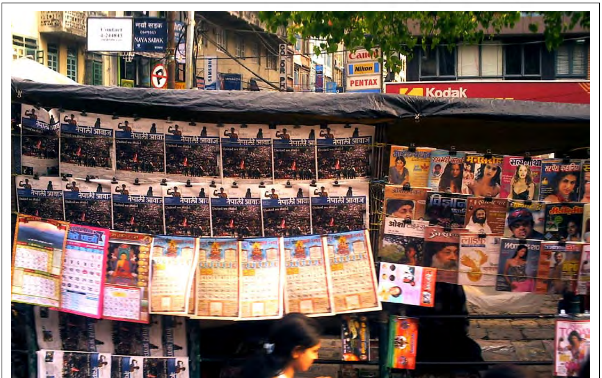
Nepali Aawaz launched its first "Nepal Edition" in Kathmandu (RB Distribution), Pokhara (Safal Media), and Purbanchal (Birat Media) in Nepal during the last two weeks of April. Above: The paper on display on newstands in New Road.