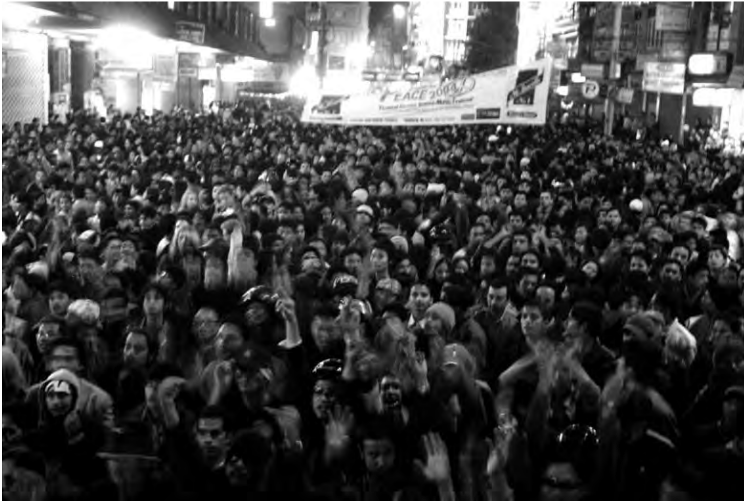
Thousands converge in Thamel, downtown Kathmandu, to dance in Party Nepal's annual Project Peace dance festival