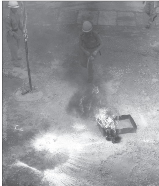
Sikkim firemen display their fire-fighting skills at an exhibition held at MG Marg as part of the Fire Safety Week observation on 14 April.

He says that it is important for each fire station to have at least two fire tenders. This will be possible with the Rs. 1 crore sanctioned by the central government. He reveals