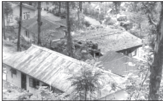
The old CRPF Colony at Mangan

This culinary delight was followed by Hindi films brought by the CRPF jawans from Gangtok. A screen would quickly be put in place nailed to two bamboo poles along the road next to the Colony.