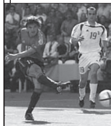
Fernando Morientes of Spain

Today, 20th June, 2004 - Spain vs Portugal on ESPN at 23:30 IST