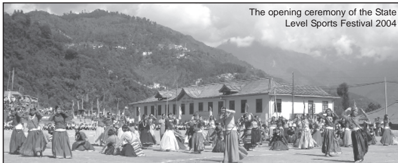
The opening ceremony of the State Level Sports Festival 2004

He added that the Chief Minister harboured the dream to make Sikkim produce more sport-stars like Baichung Bhutia, Rupen Pradhan, and Tarundeep Rai. Such tourneys could help realise this dream, he said.