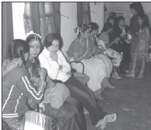
Participants chat up in the green room awaiting their turn on stage