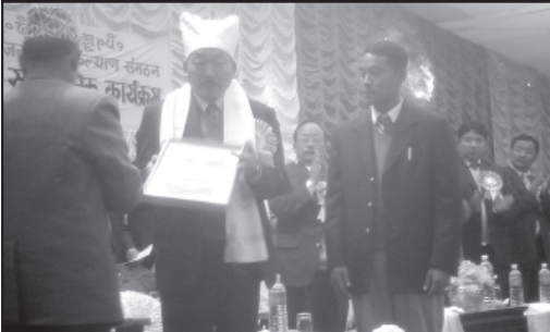
The Chief Minister being felicitated by the Gorkha Limbu-Subba Scheduled Tribe Welfare Organisation at Darjeeling on Saturday

"We have to change with times. Just being known as a brave race will not help us achieve much in this century. We should rather eye the service sector and make tourism and natural resources our main forte," he added.