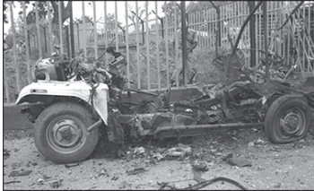
The wreckage of a jeep that was used to blow up part of a wall of the high-security complex at Ayodhya. Unidentified militants blew up a security wall with a car bomb and stormed the Ram Jannabhoomi site setting off a fierce gunbattle with police and paramilitary forces that left all five attackers dead.

LUCKNOW, 05 July: Suspected militants blew up a security wall with a car bomb and stormed the Ram Jannabhoomi temple complex in Ayodhya this morning, triggering a gunbattle in which security forces killed five attackers.