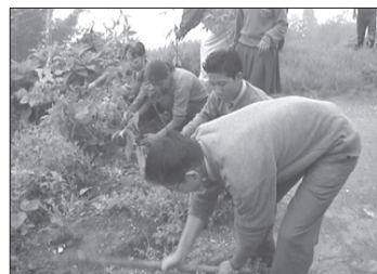
Students of Thumi Sambhota School and members of 22 Buddhist associations [jyiduk] undertake plantation work at Bhola Solsa, Chandmari, on 04 July as part of the festivities to mark the 70th birthday of His Holiness the Dalai Lama which falls on 06 July.

Officially, the day will begin with the offering of juniper incense and the flying of prayer flags in the morning. The portrait of His Holiness the Dalai Lama will then be received at Sera Gonpa, followed by Indo-Tibetan