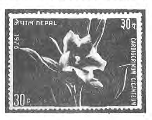
TRANSPOSED NAMES ON THE 1976 30p FLOWER SET --M. W. Campbell

The predominantly greenissue is labelled Megacodon stylophorus when, in fact, it depicts Cardiocrinum giganteum (a Lily). The predominantly purple stamp of the issue is the Megacodon, but is labelled Cardiocrinum.