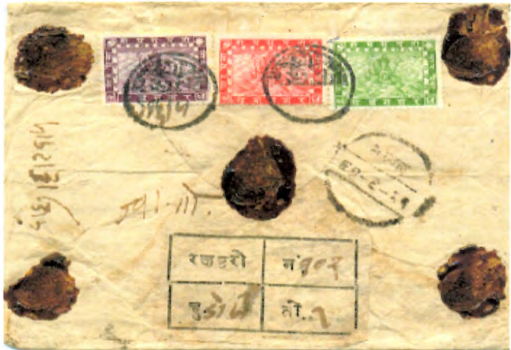
Double rate registered cover sent from Doti to Kathmadu dated October 1910 using the scarce registration label with the 'Hu' character undamaged.

QUARTERLY OF THE NEPAL AND TIBET PHILATELIC STUDY CIRCLE