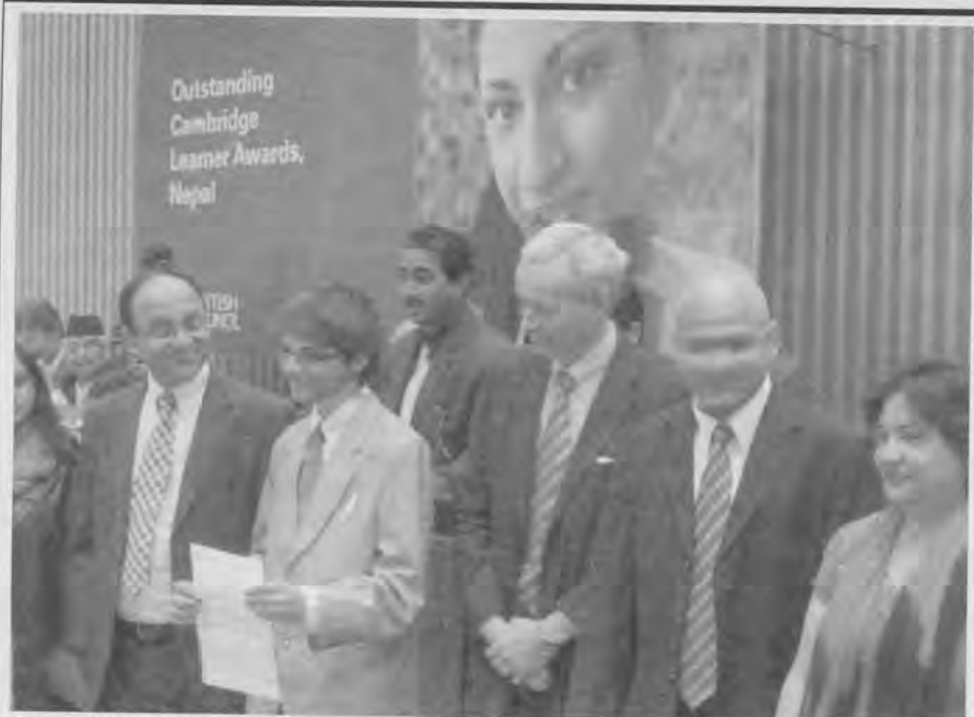
Cambridge Award Ceremony