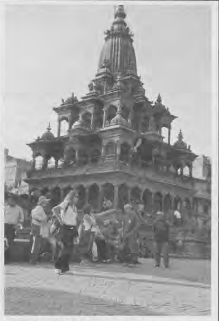
Tourist in Krishna Mandir

loadshedding has marred almost all the hotels of the valley and demanded a solution.