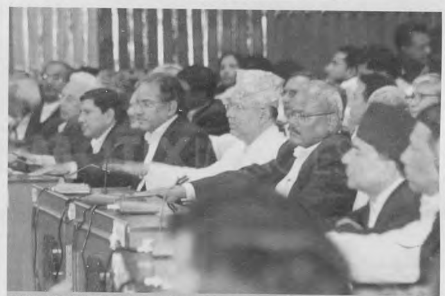
COVER STORY: Constitutional Conundrum Front Cover Photo: Manish Gautam

Vol.: 04 No.-20 April 08-2011 (Chaitra 25, 2067)