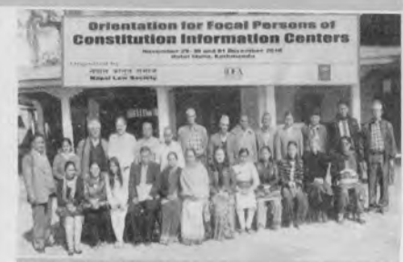
NEPAL LAW SOCIETY: Bridge Linking People