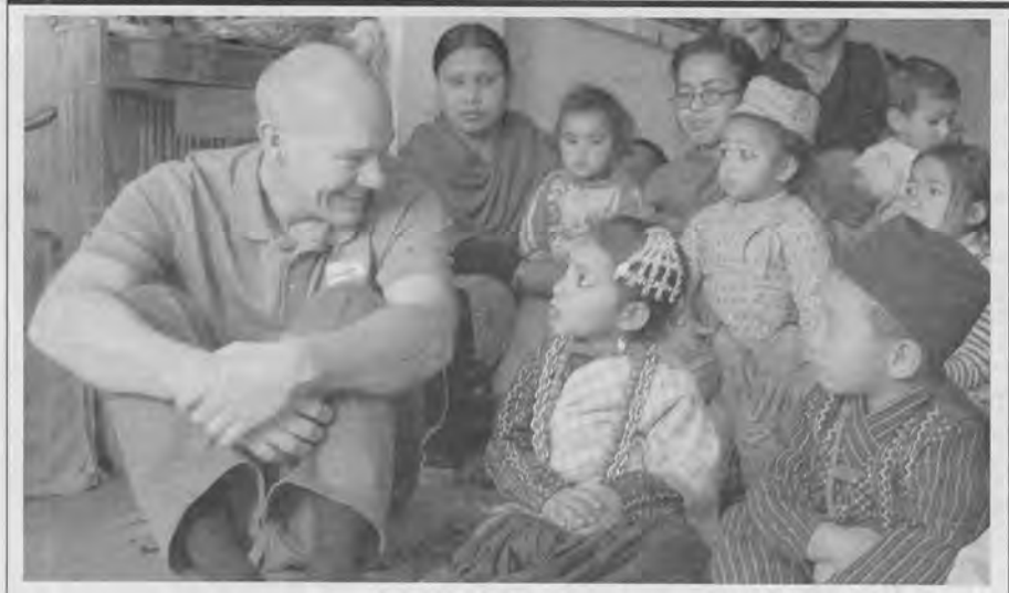
WORLD VISION CHIEF IN NEPAL