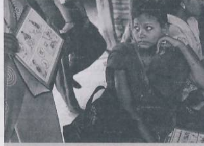
HEALTH: Teenage Pregnancies