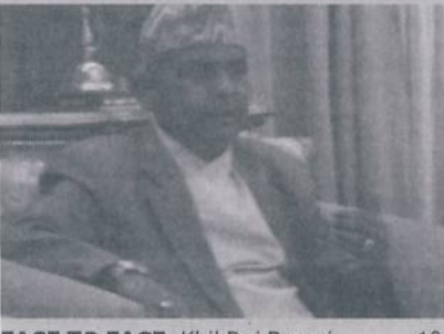
FACE TO FACE: Khil Raj Regmi