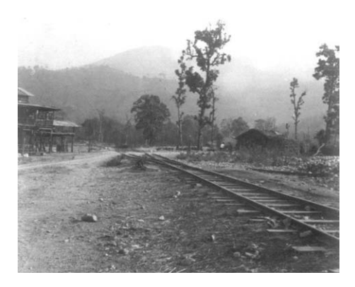
The line close to Ghopa camp (Dharan)

From Chhakraghatti a branch ran northeast to Dharan where it ended after about eight miles at a stone loading area just northwest of Ghopa camp of the