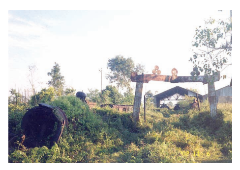
The old railway yard near Ghopa Camp (Dharan)

From the bridge site we worked our way back eastwards towards Dharan, picking up the line of the railway as we approached the Dharan – Chhatra road where there had been a level crossing. People we spoke to confirmed that there had been a railway and that beyond the crossing there had been a stone loading place. Two elderly gentlemen, Bakta Bahadur Bhandari and Rewenta Shrestha aged 68 and 67 eagerly told us where the tracks had run, where there had been