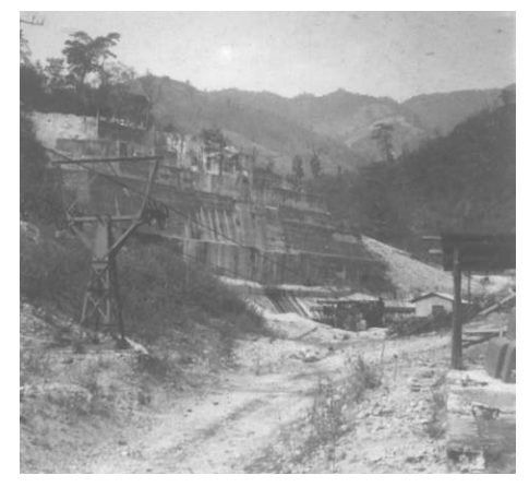
Thought to be near Phurse camp, the construction camp set up during the building of Dharan cantonmemt

(This article first appeared in the 'Darjeeling Mail' - the magazine of the Darjeeling Himalayan Railway Society) (A 'gricer' is slang for 'train spotter', hence the verb 'to grice'.)