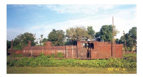
Koshi project railway, disused engine at Chhatra

land in India, not Nepal. By taking water from the Kosi River at Chhatra where the river emerges from the hills, this newer irrigation scheme supplies a main irrigation canal which leads off eastwards through the almost flat land on the Nepal side of the border. Considerable expense had been involved to ensure that the Kosi Project Railway, although diverted, was not severed by this new irrigation scheme. At one point near Bich Pani where the railway had been diverted by the new canals, we could see where a steeply graded and curved piece of line had run, with the marks of the sleepers still clearly visible in the ground. At two different points along the route were the remains of bridges with two piers where the railway