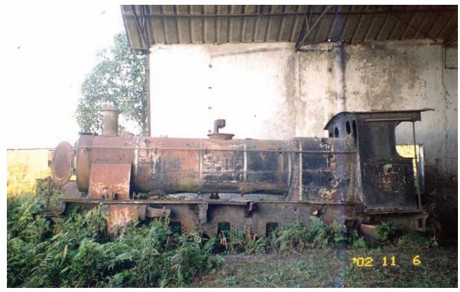
Koshi project railway, engine in shed

had crossed tributaries of the Kosi River. Finally we came to Chhatra and there on a mounded earthwork was a metal tank which I was assured had been used to fill the engines. There were no railway lines on the ground but there were many in use as telegraph and electricity poles near the site of the railway sidings and around the village of Chhatra, One had 'Rhymney' rolled on its web and another 'Moss Bay Company' - the original name of the company with the rolling plant at Workington in Cumbria. Thus are the names of British steelworks preserved on third-hand rails in Nepal for the determined gricer to decipher.