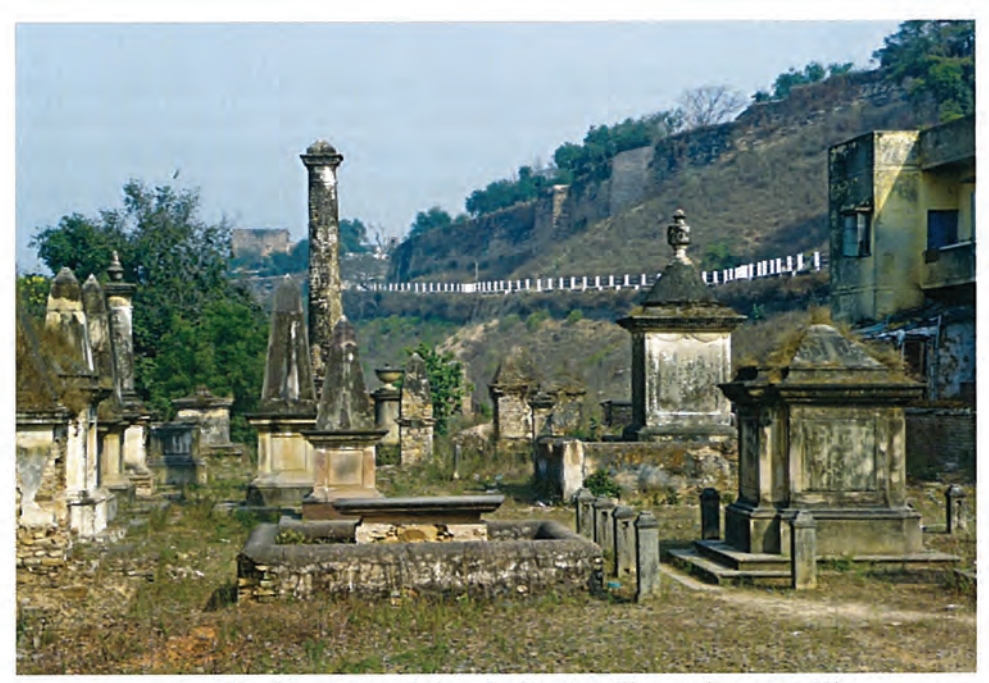
top: 'the old cemetery below the Fort' at Chunar (see page 25) below: the Remount Depot cemetery, Babugarh (see page 30)