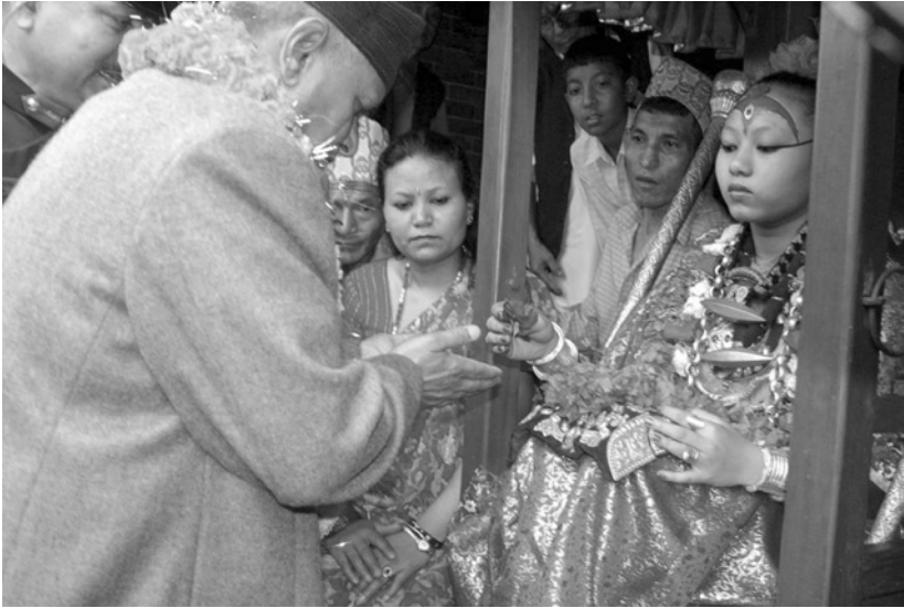
Plate 4. Nepal's President, Ram Baran Yadav, receives a blessing from the Kumari of Lalitpur.

of Kumari under the scrutiny of the court in the name of child rights. 35 The case did not concern only the famous (national) Basantapur Kumari, who traditionally blessed the king and now blesses the President during her annual chariot festival, but concerned all the children worshipped as Kumaris in the Kathmandu valley. 36 The PIL was filed while the state was still a Hindu kingdom, and the verdict was rendered in 2008, when the state had become a secular republic. No explicit reference to secularism was made in this case, and yet it allowed the judges to reflect on the relation between religion and the state, and their judgement can be seen as a landmark case for secularism. The very fact that the goddess was scrutinised in a court as a human being capable of being deprived of human rights mirrors the political and symbolic transformation of that period.