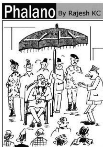
Plate 1. On the day of Ram Nawami (24 March 2010), President Yadav and former king Gyanendra Shah both visited the Janaki temple within the space of only two hours. Each of them entered the temple for the puja shaded by the same honorific parasol (source: Republica, 26 March 2010).

Mr President !... Ex-King wants the umbrella back.