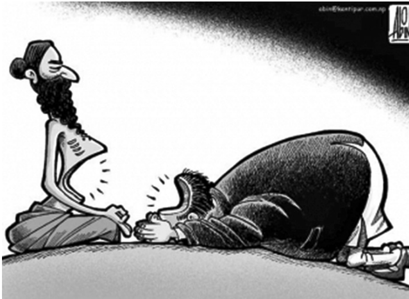
Plate 5. A cartoon mocking political leaders, including from the UML and UCPN (Maoist), who along with thousands of other people attended Swami Ramdev's yoga camp in Kathmandu in March 2010

To the disbelief of Maoist cadres, the Maoist leader Prachanda worships a buffalo in a religious camp in Chatara, Sunsari district, to appease the