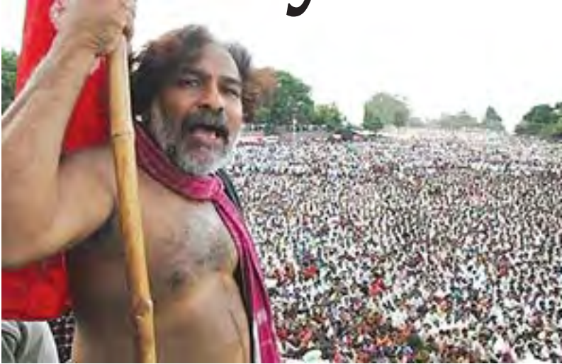
TWIN REVOLUTIONARIES: Telugu poet Vara Varu Rao who is considered the face of the Naxalites (left) with balladeer Gaddar (right) acted as an emissary for Indian Naxalites.

Indian Maoists are feeling vindicated by the recent setbacks suffered by their Nepali comrades and are full of scorn for them. Here in Andhra Pradesh, which has been a hotbed for Naxalite activity because of government neglect and entrenched caste and class inequities, the Nepalis sold out on the revolution when victory was so close at hand. Indian and international Maoists always saw Nepal as a vanguard of their revolution. They provided training and material assistance in the early days, and they saw Nepal as a source of hope during the war. The disillusionment first set in when India’s moderate left which is a partner in