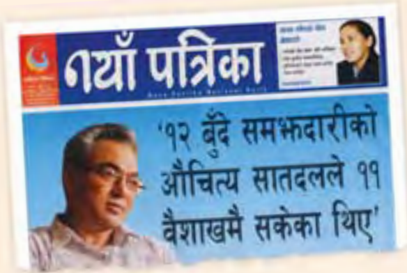
Interview with Ram Bahadur Thapa (Badal) in Naya Patrika , 6 November

Naya Patrika: What is the message from the voting in parliament on Sunday? Ram Bahadur Thapa: First, the people want a republic and full proportional representation. Second, the government and other conspirators are bent on not letting these two proposals through. Third, some international powers are still trying to prop up the monarchy.