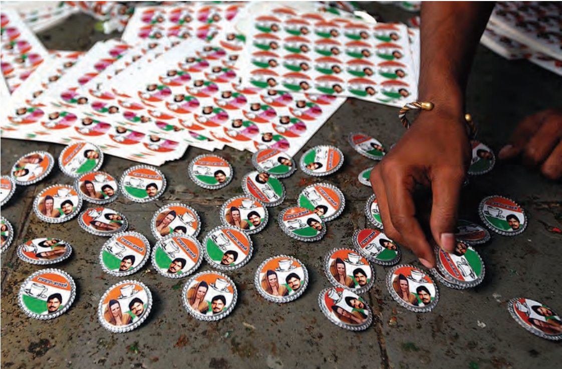
AL JAZEERA ENGLISH

As India conducts its 15 th Lok Sabha elections, it provides a remarkable example to the rest of us South Asians on how to manage diverse aspirations within a democratic political framework. ●