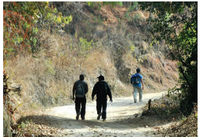
CHONG ZI LIANG

The village itself is picturesque with the 15 th century Adinath Lokeshwar Temple dedicated to Rato Machhendranath with an astounding array of metal pots, pans and water containers hanging from its roofs—kitchen utensils donated by newlyweds to ensure a happy marriage.