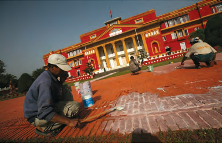
FACE LIFT: A painter at work at the premises of Shital Nibas, the office of President Ram Baran Yadav.