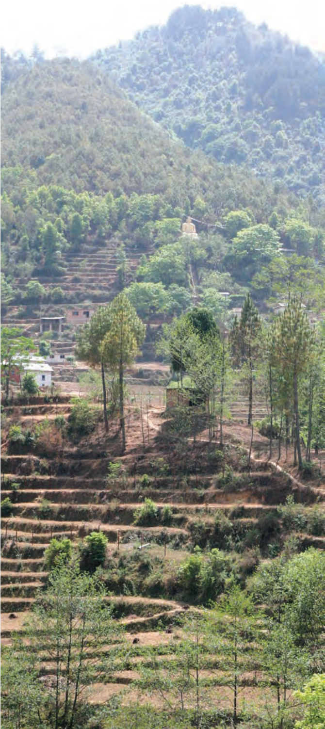
MIN RATNA BAJRACHARYA

The mountain is lushly vegetated and the footpath pretty untrodden—though there is also a steep and slippery track that snakes its way up to the summit. Pulchoki is home to 570 species of flowering plants, including magnificent red and white rhododendrons in March and April and a third of Nepal’s bird species.