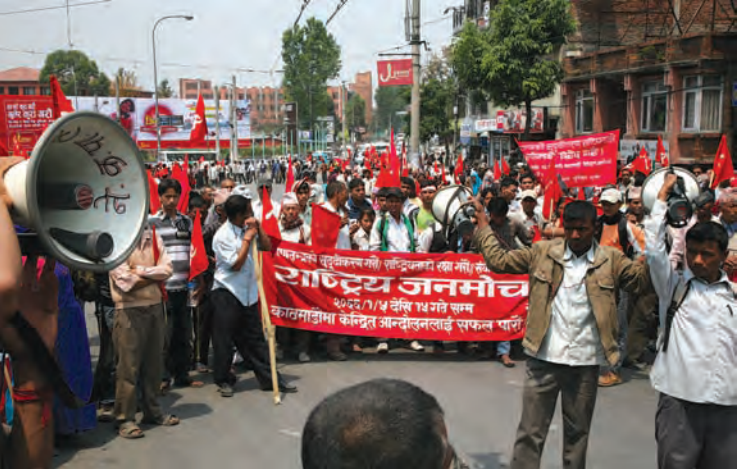
ONE TRACK: National Janamorchha Party stages a 10-day protest against federalism at Maitighar Mandala on Monday.