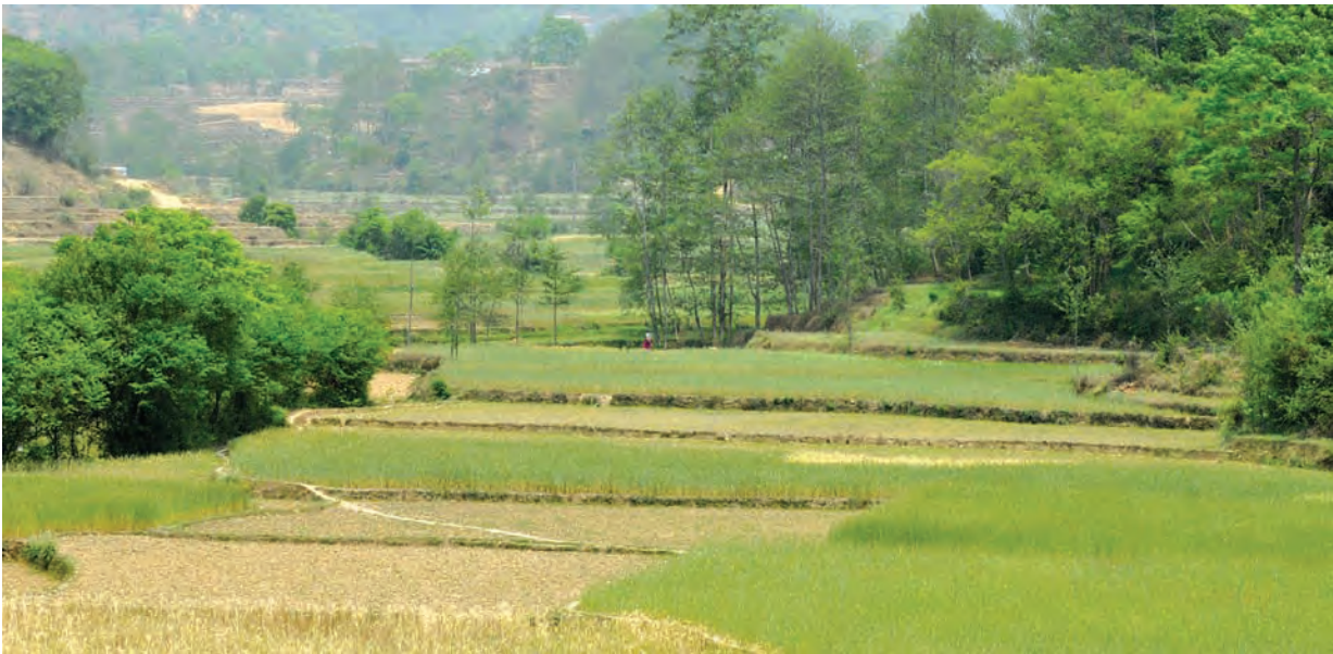
CHONG ZI LIANG