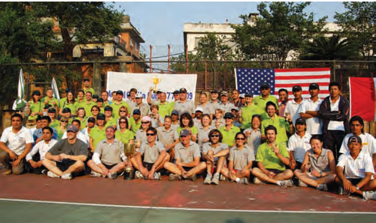
AMERICAN ACE: The Commonwealth and US tennis teams celebrate after the US won the Quetta Cup double's tournament at Phora Darbar on Saturday.