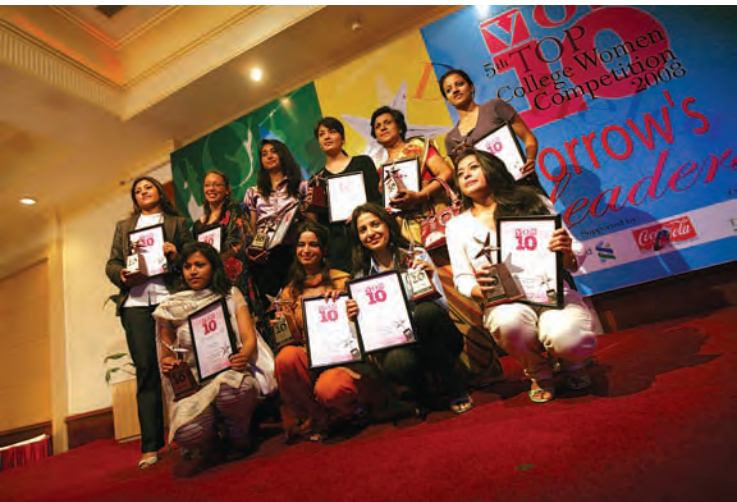
MODEL STUDENTS: Winners of VOW Magazine's Top 10 College Women collect their awards at Everest Hotel on Sunday.