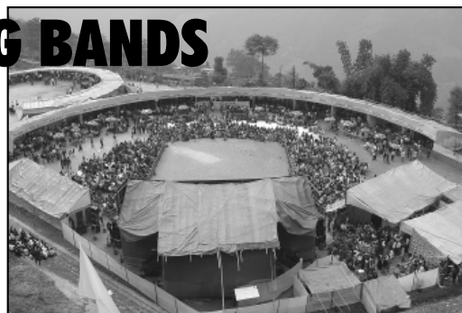
The Mangan Public Ground at last year's Centenary Celebrations

And what will be the criteria for judging? "Quality of vocals and musical ability, presentation and showmanship along with popular appeal," state the organizers emphatically, adding that the band will not be allowed to "Misbehave onstage, use abusive language