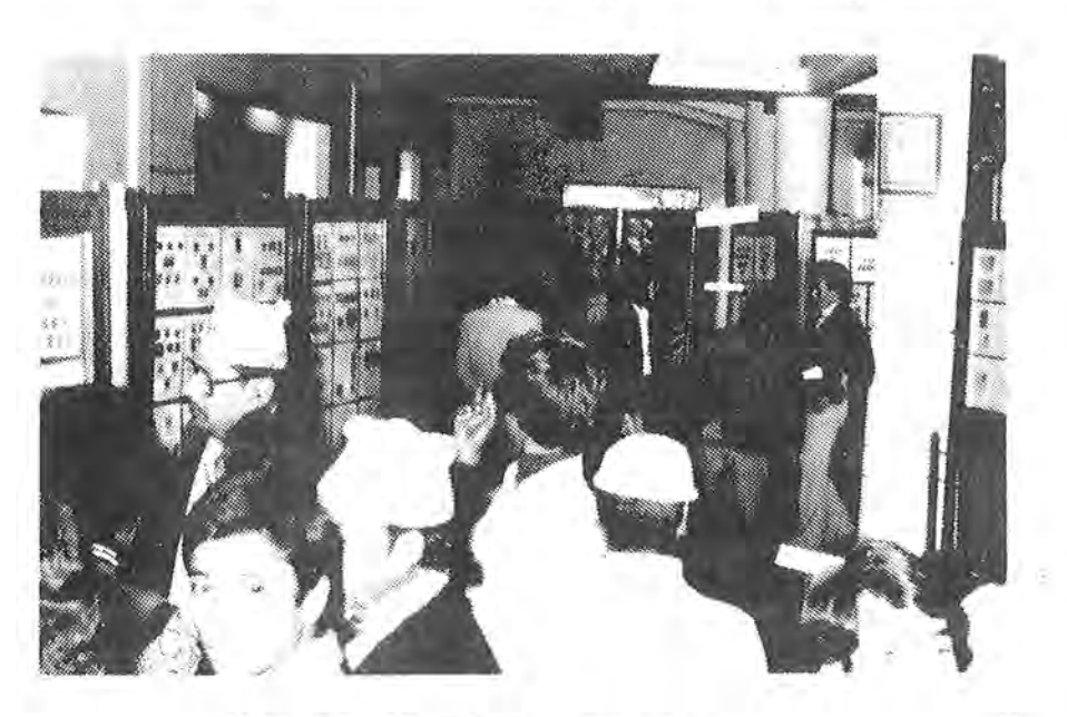
View of the Exhibition Hall.