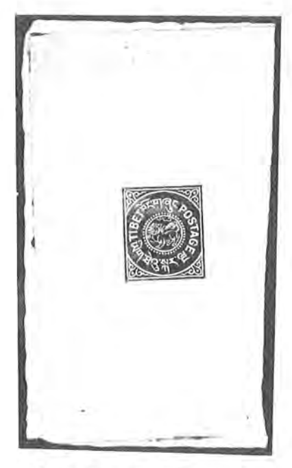
This Waterlow essay (1/3 tr in blue) brought $1,050 in the Alevizos auction of July 1981.

The 200 lots of postal history material alone make this catalogue an important reference work for Tibet specialists. In