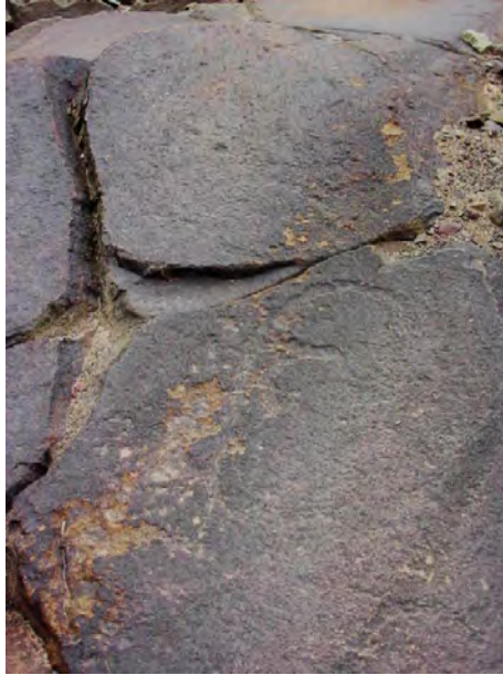
Figure 9: Petroglyphs at the feet of the fort. Here, two foot print motifs.