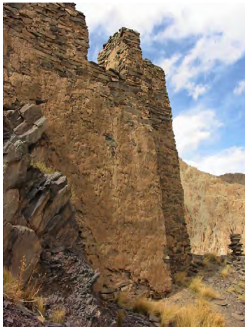
Figure 7: Building at the core of the complex. [Credits: Vernier 2004]