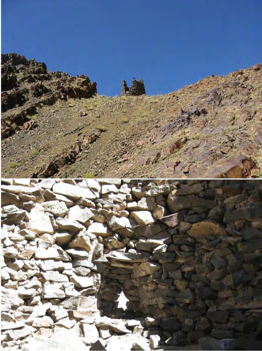
Figure 11: The watch tower at the valley's turn.