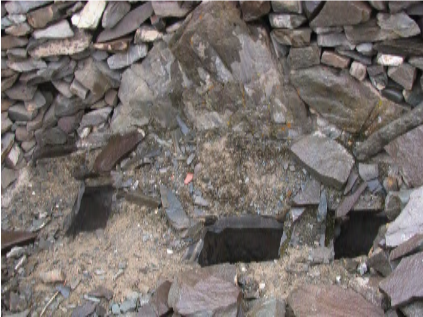
Figure 5: Detail of a box-like floor structure.