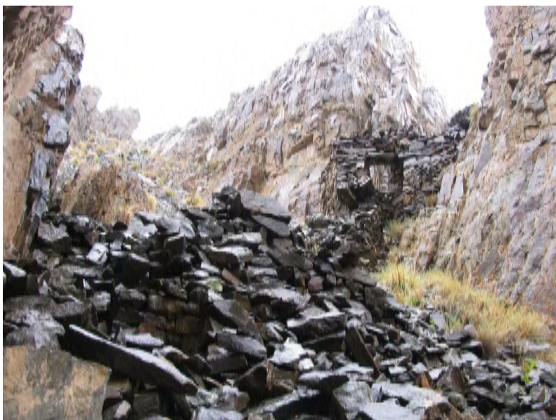
Figure 4: Protected stairways on the southern side.