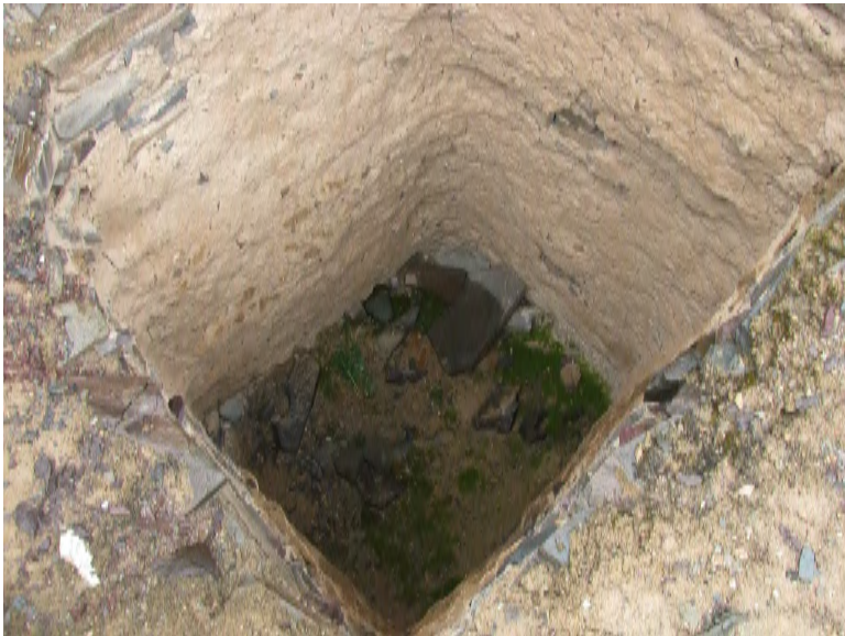
Figure 6: A larger box-like floor structure, possibly used as a storage silo.