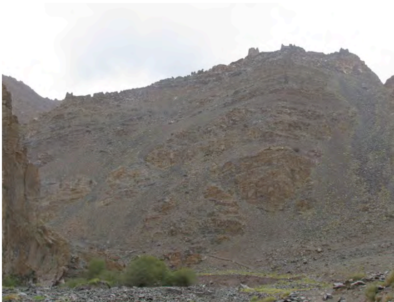
Figure 2: The north-eastern slope, towards Stok valley.