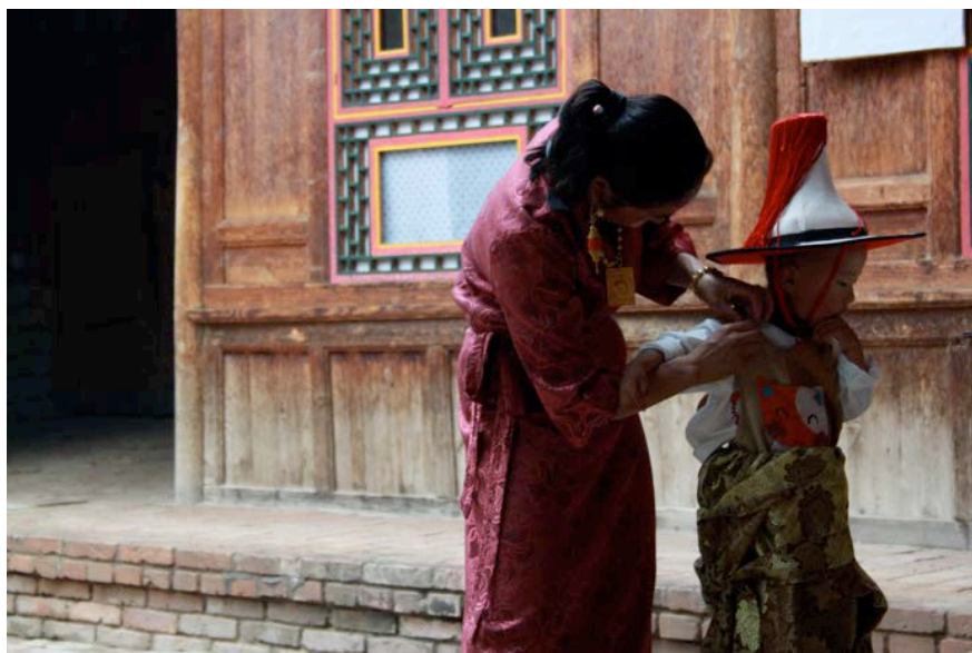
The red-fringed hat and the earrings worn in the area of Rebgong during the Lurol festival in Gnyan thog village

In the iconography of the three brothers of Amye Drakar, the red-fringed hat metonymically symbolises Mongol otherness and the cliché-prophecy embodies a reflection and a resolution of the destiny and the place to be occupied by Mongols in the local geography. No matter how threatening and unwelcome the Mongols might have been, they had to fit somewhere in the landscape and mindscape of the local Tibetans; their presence had to be elaborated and processed in the framework of the intimate Tibetan contiguity between people, landscapes and territorial gods that characterise their relationship to the land. It is precisely this epistemology that sustains the transposition of Mongols onto a legendary conversion and incorporation in the local pantheon.