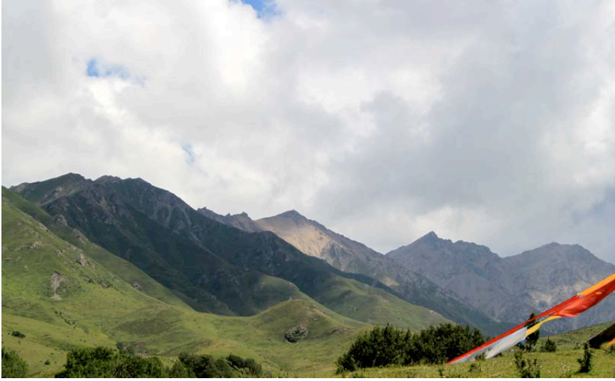
The three rocky peaks of A myes Brag dkar spun gsum.

While sipping his butter tea, he recalled episodes from his intense and personal relationship with the gods, who had been constantly present in his life through dreams, epiphanies, prayers and paintings.