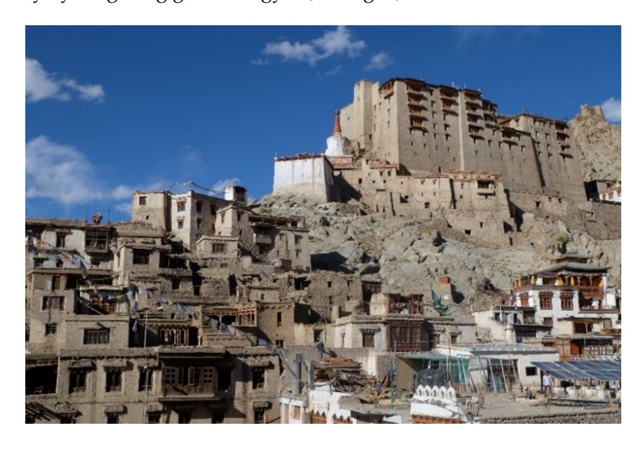
Fig. 5 — Palace and old town in Leh.

Last but not least, social and economic functions of the court as place of everyday life and centre of consumption shaped the architectural environment by creating quarters for aristocracy, crafts, and trade in the immediate vicinity of the royal palace. The royal residence itself dominated the surrounding landscape and conveyed the superior position of its inhabitants. In votive inscriptions, the royal buildings are depicted as heavenly palaces on earth and are therefore symbolically elevated—an attribution of a supernatural aura that reflects the special status of the rulers.<sup>54</sup> The royal palace in Leh—a nine-storeys high building—was constructed during the first half of 17<sup>th</sup> century by king Seng ge rnam rgyal (see Fig. 5).