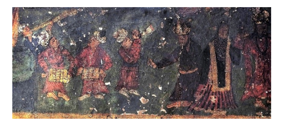
Fig. 4 — Court musicians and dancers, Leh (rNam rgyal rtse mo).

Another group to be represented in visual media are the court dancers: just like the musicians, they too contributed to the image of the king and his entertainment (see Fig. 4). Selected families were obliged to provide one dancer each whenever the king requested their services and were rewarded with food. Furthermore, it was considered a privilege to be ordered to dance at the royal court and thus contributed to the prestige of these families.<sup>51</sup>