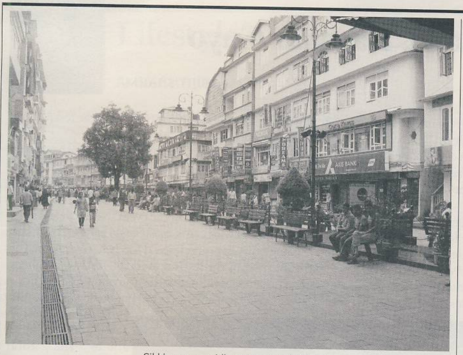
Sikkim was rapidly going up in tourism.